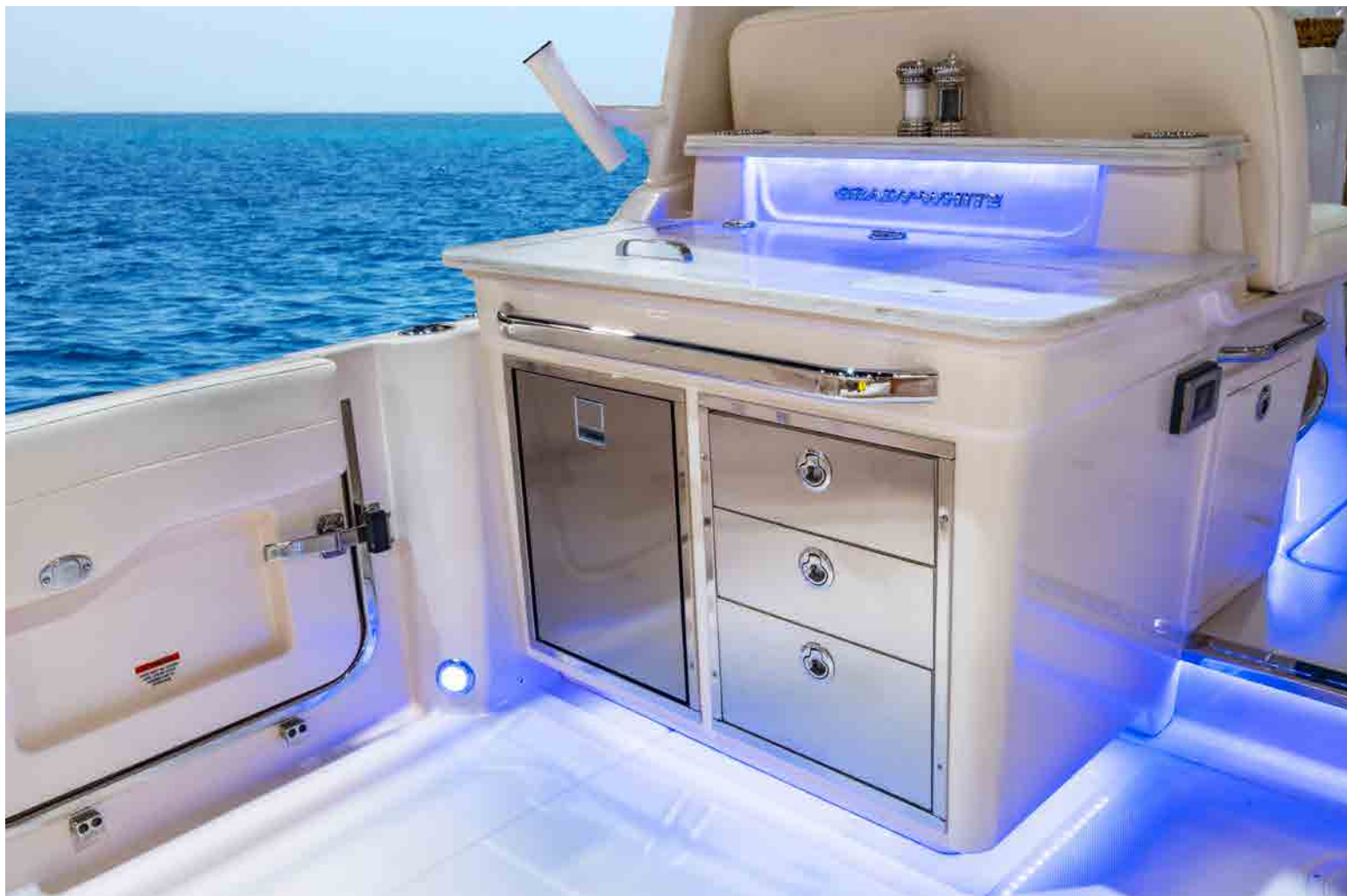
The aft-facing outdoor galley with grill, sink and refrigerator drawer can also be used as a rigging station. Grady-White

The cockpit has a rigging station/wet bar with refrigerator, drawers, grill, freshwater sink and trash bin on the port side and an adjustable mezzanine seat to starboard. The inboard mezzanine seat acts like an electric recliner. You can slide the seat in and out to create more walking room in the cockpit when needed. The transom houses a large refrigerator/freezer box for keeper fish or provisions. Hot- and cold-water hoses are right where you want them to shower off after a swim. A transom live well keeps baits close at hand, and Grady-White placed a cutting board on top of the port transom hatch so you have a spot to slice up limes or cut bait.