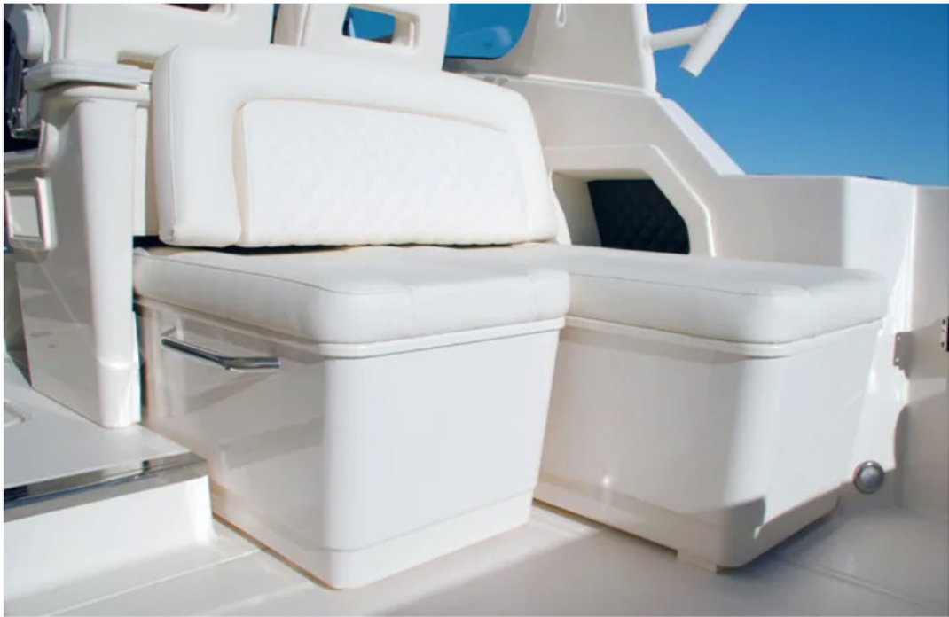
The inboard portion of the mezzanine seat is retractable so you create more walking space on deck.

The cockpit has a rigging station/wet bar with refrigerator, drawers, grill, freshwater sink and trash bin on the port side and an adjustable mezzanine seat to starboard. The inboard mezzanine seat acts like an electric recliner. You can slide the seat in and out to create more walking room in the cockpit when needed. The transom houses a large refrigerator/freezer box for keeper fish or provisions. Hot- and cold-water hoses are right where you want them to shower off after a swim. A transom live well keeps baits close at hand, and Grady-White placed a cutting board on top of the port transom hatch so you have a spot to slice up limes or cut bait.