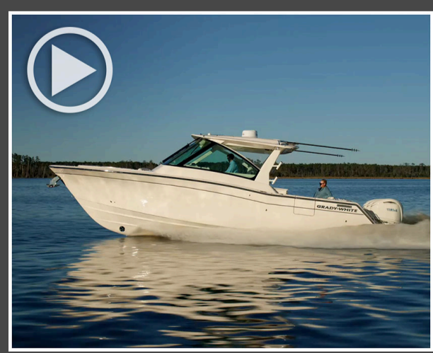
Watch the Walkthrough

Overflowing with luxury, exceptional details, and fine craftsmanship, the new Freedom 345 stands out in a class all its own. Mirroring its sister ships, with luxurious appointments from the Freedom 415 and rugged fishability cues from the Canyon 386 , the new 345 delivers the ultimate in boating satisfaction in a slightly smaller package. See what everyone was raving about at the Fort Lauderdale International Boat Show.