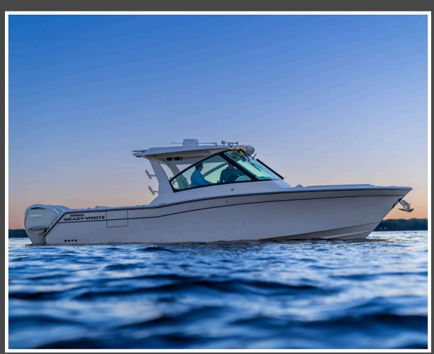
Build Your Freedom 345