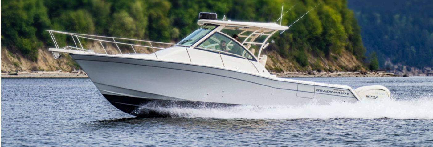
The Northwest Grady-White Club enjoys their adventures even on chilly days!