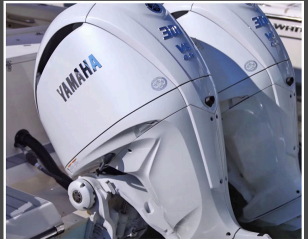
Engine Maintenance 101