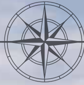
CHART YOUR COURSE