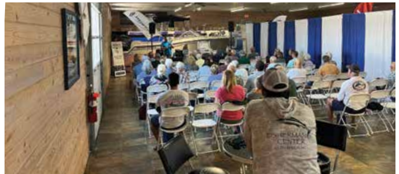
Taylor Marine Center in Milford, Delaware successfully hosted its annual Fishing Seminar, focusing on community giving. Attendees contributed non-perishable canned goods for the Delaware Food Bank. The event featured offshore and inshore fishing presentations by local experts.