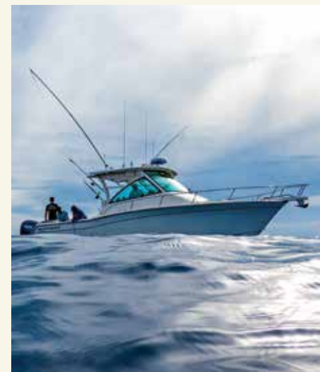
On the cover: Brad French enjoys marlin fishing aboard his Express 330 in the waters off Sydney, Australia.