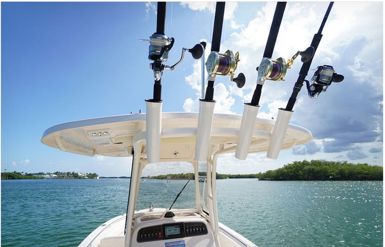
Extra storage for rods is available overhead in the built in hard top frame over the cockpit.