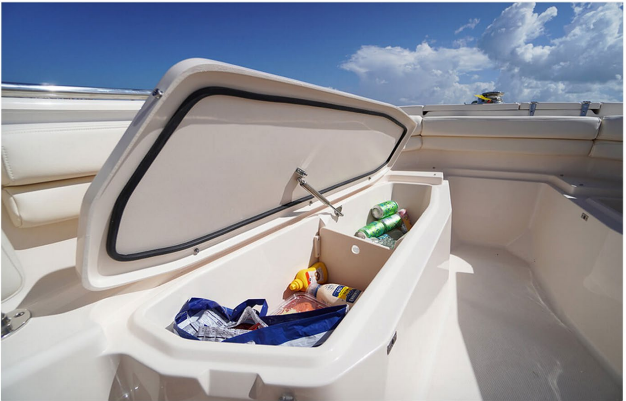
The insulated space beneath the forward seating can be conveniently partitioned off to separate food from drinks.