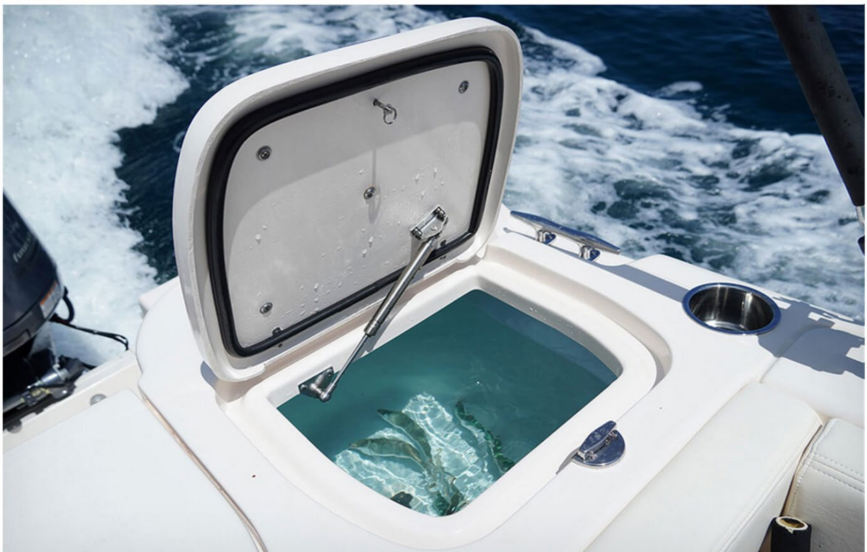
Grady-White has incorporated this 32-gallon illuminated live well into the transom to port for healthy baits and convenient access.