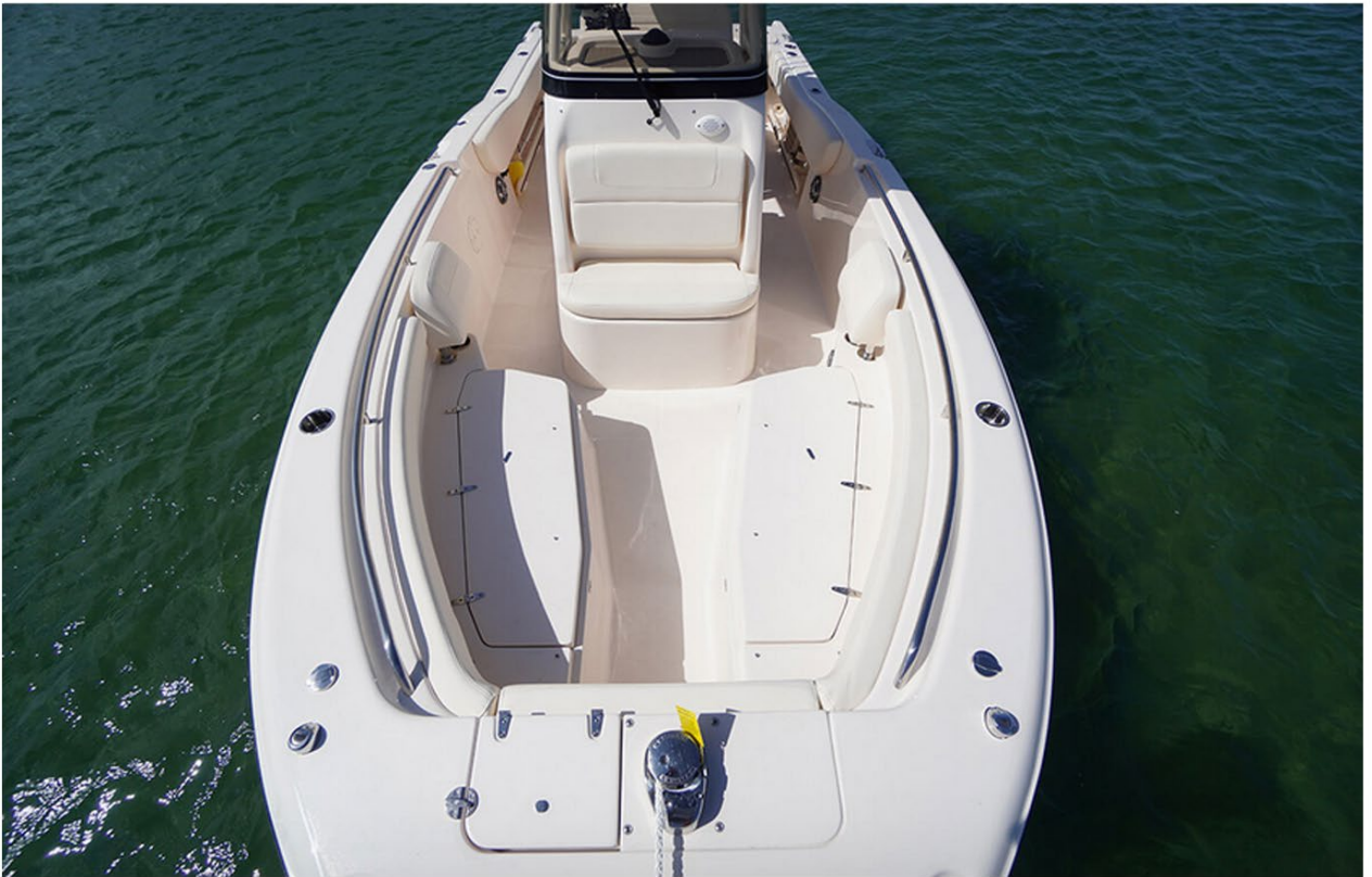
A gap between the forward seating at the centerline allows easy access to your anchor and room to fight a fish around the bow.