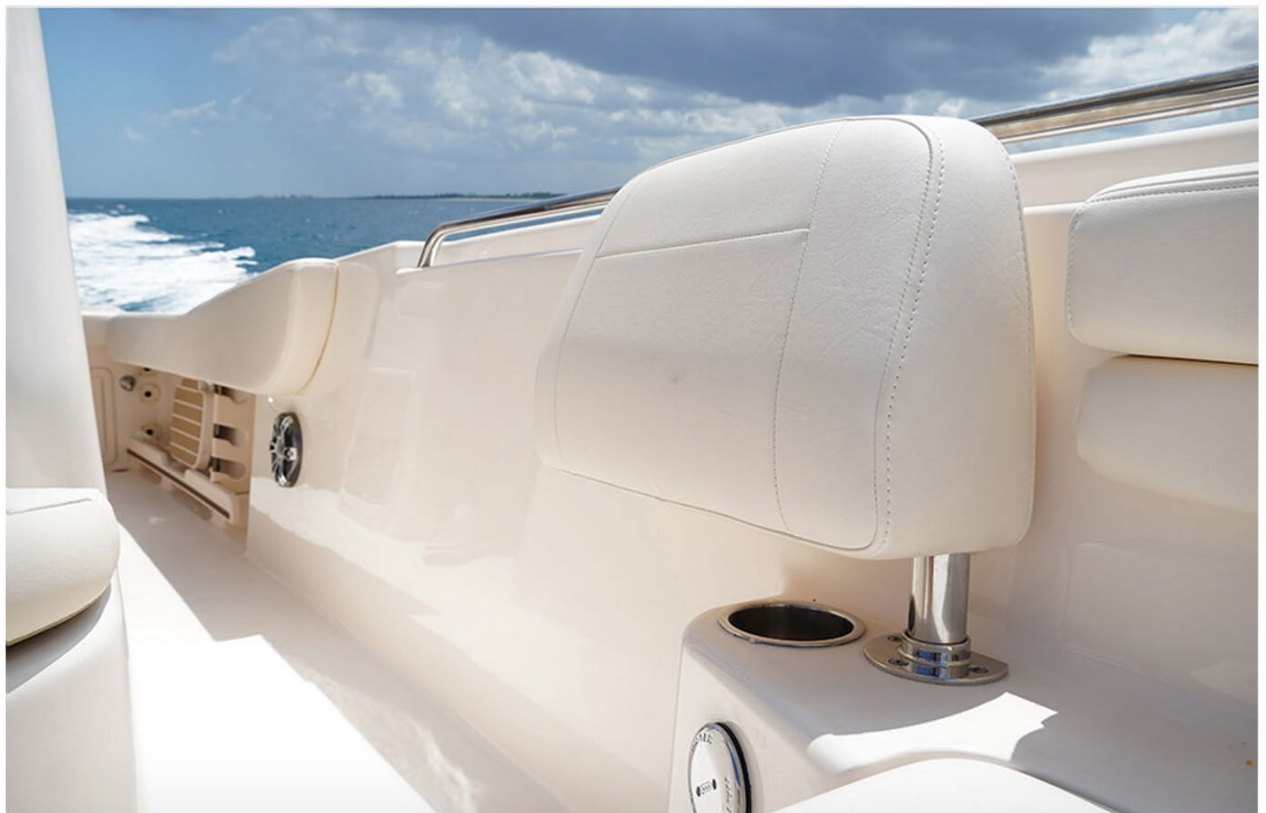
This beautifully contoured backrest swivels forward for lounging or outward to incorporate into the forward bolster design.