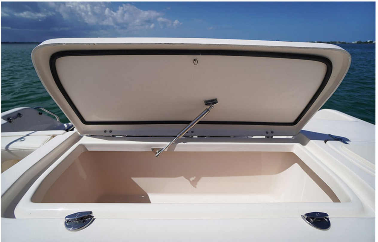
A large 185-quart insulated compartment in the cockpit complements the matching 120-quart boxes in the bow.