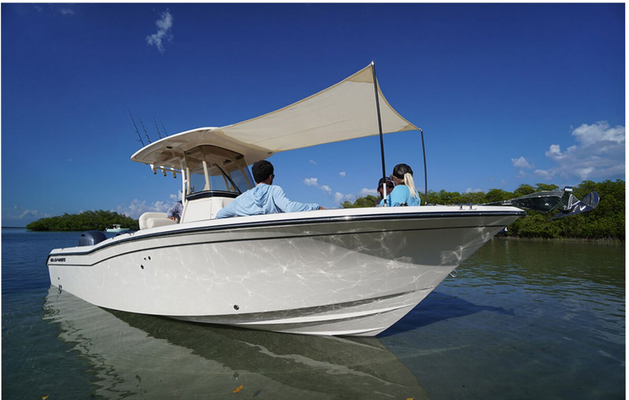
The addition of this portable sun canopy adds welcomed shade to those seated in the bow while relaxing at anchor or on the sand bar.