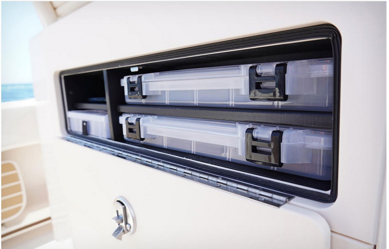
Tackle storage is conveniently located in the cockpit behind the helm station for ready access to essential gear.