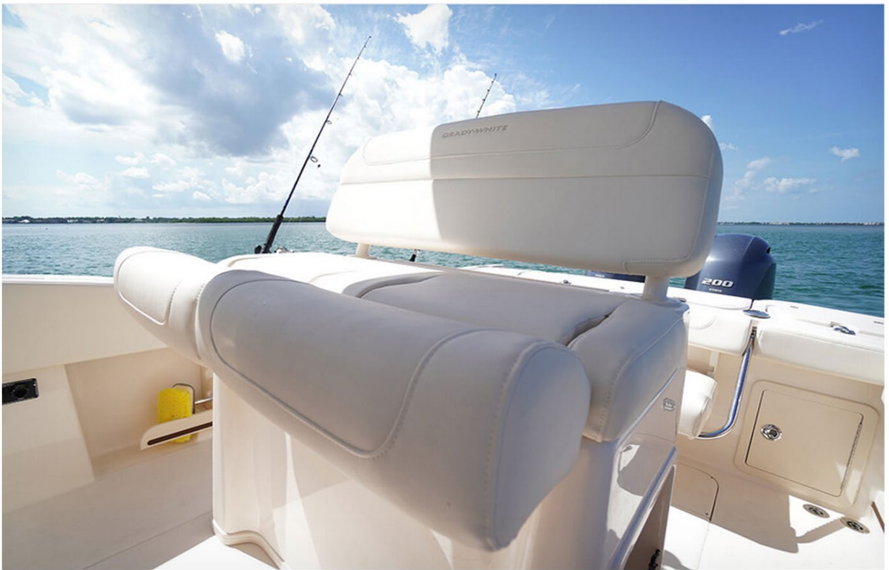
This no-nonsense helm station offers comfortable seating for two and a practical use of space behind the wheel.