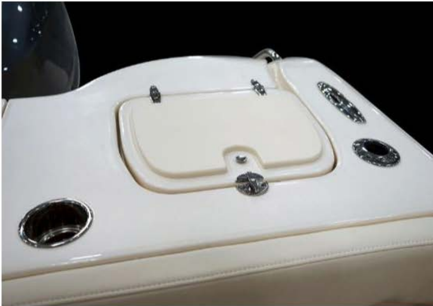
Showing the details we expect from Grady-White, the livewell hatch has a cutting-board on the hatch.