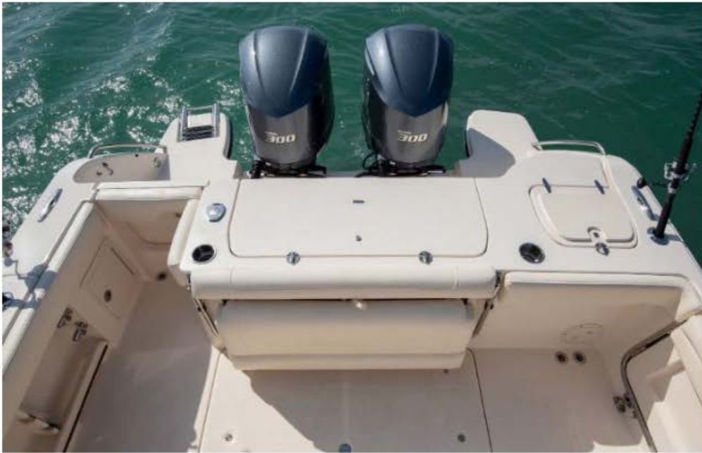
The Canyon 326's cockpit shows the mix of fishing and cruising amenities from the livewell to the foldout seat and pull-up shower.