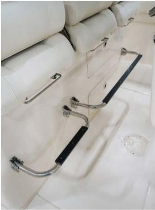
Fold-out footrests on the helm-seat console add to the comfort.