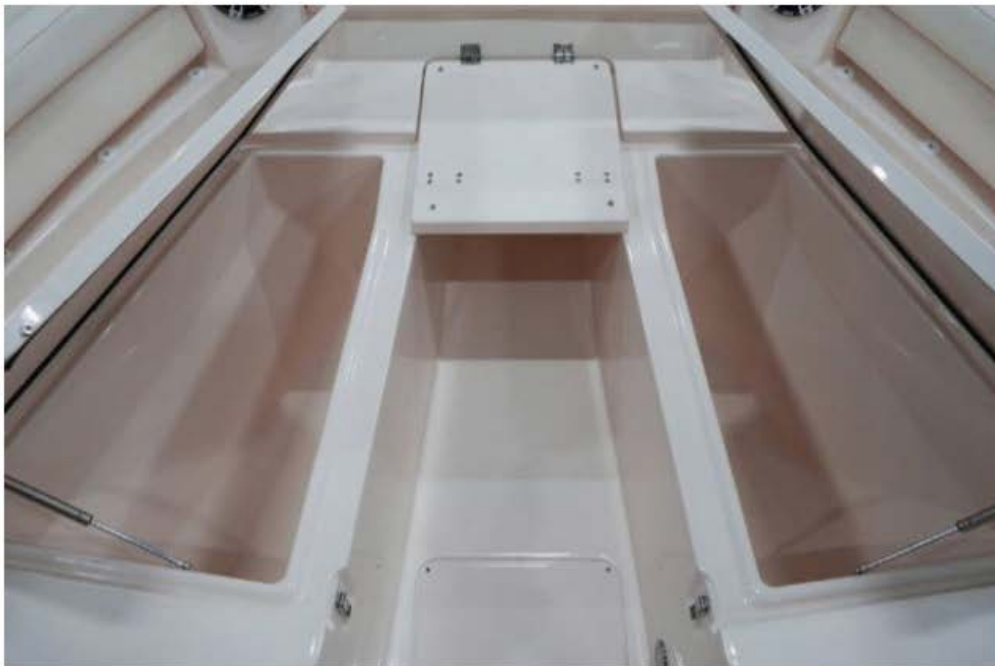
Beneath those comfortable lounges, the Canyon 326 is still a fishing boat at heart with twin insulated fishboxes ready for the day's catch.