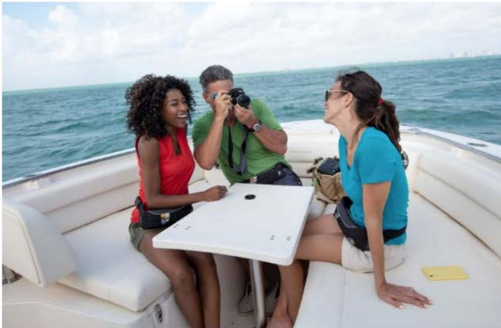
An optional table adds to the versatility of the bow.