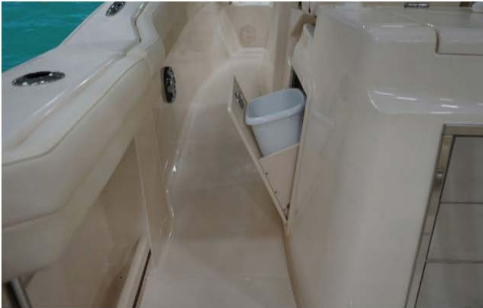
The wastebasket tucks into the helm-seat base so it's out of the way when it's not needed.