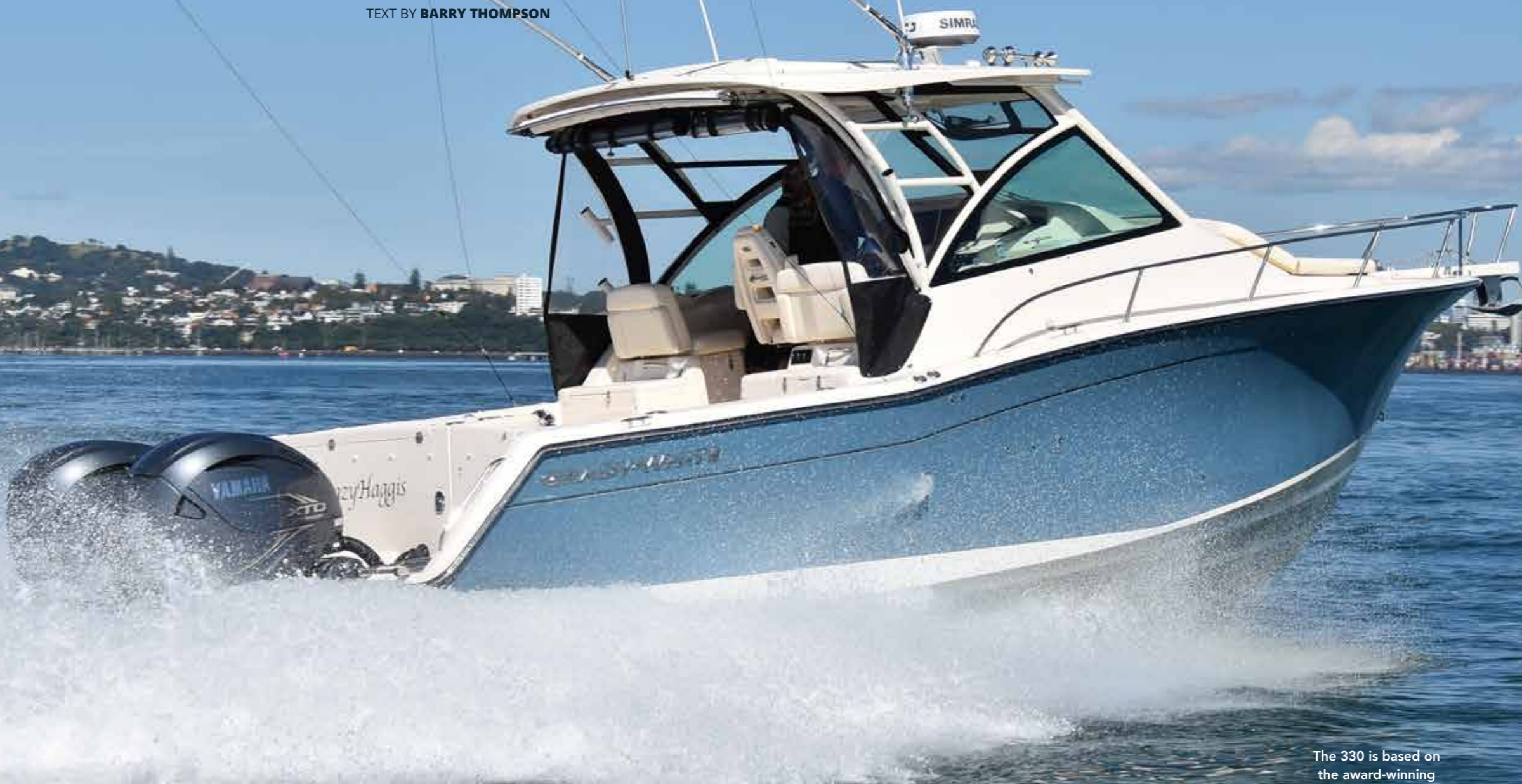
The 330 is based on the award-winning SeaV2 hull.