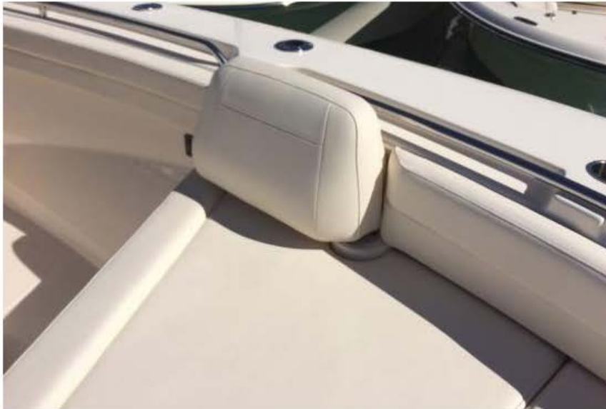
A rotating seat back allows the seats forward to be used chaise-style with guests facing forward. Note the fine upholstery job. Remember, this is a center console extraordinaire.