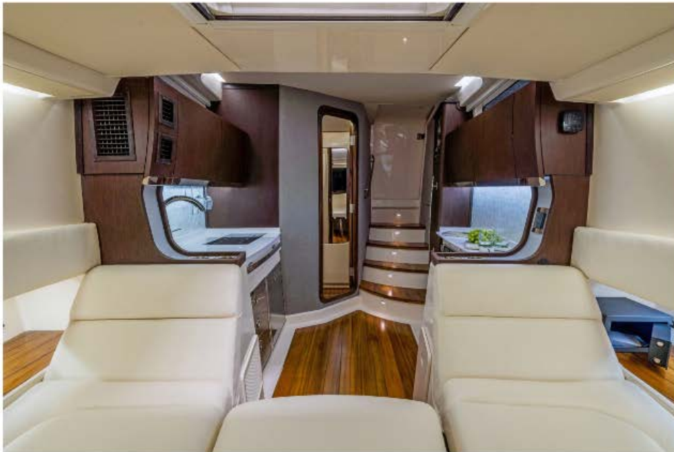
The cabin on the Canyon 456 is an oasis of tranquility and a refuge from the heat or rain topside. Note the cabinets above the Corian® counters and cooktop to starboard.

The Galley. Below the portside countertop is a full-size microwave drawer, and a six-bottle wine cooler. A stainless steel sink and cooktop are located amidships on the starboard counter, with a refrigerator below. Lighted glass shelves are above the counters on each side.