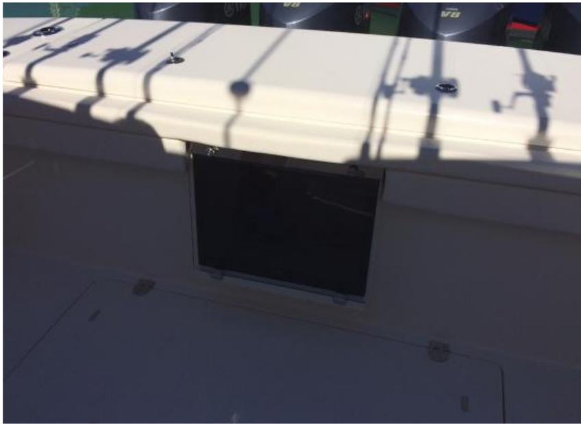
While this is not a good photo due to the setting sun, what is shown is a 24" protected screen that can display the fishfinder data or navigational details. (Dealer installed option)

Mini-Galley on Deck. Portside there is a sink with an adjustable pull-out faucet hose with spray nozzle. The starboard side has a refrigerator and grill, and both have swing-up cutting board for bait prep or dressing freshly caught fish. When in the down position, these cutting boards become a handy place for beverages or snacks, and the rails around them keep everything in place.