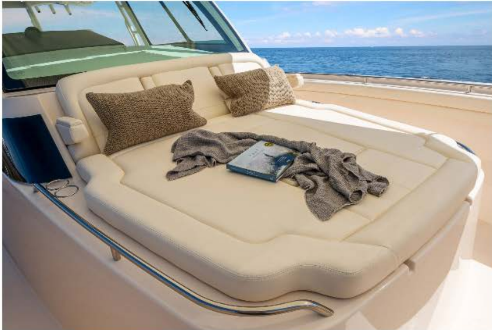
On the trunk cabin, there is a built-in sun pad with deluxe chaise seating fold-down armrests. Note the rail around the cushions.

Dining and Sunning. Atop the storage boxes, deeply cushioned seating complemented by three-way positioned stowable backrests surrounds two motorized semi-circular fiberglass tables. When the tables are in the down position, they can be covered with cushions for yet another lounging platform. One notable advantage of the semicircular tables is that they allow access all the way to the bow and windlass, and loungers need not move out of the way.