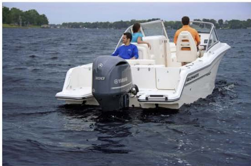
Stern perspective of the Grady-White Freedom 235 with the standard Yamaha F300 horsepower engine.

This all-new dual console answers the need for multifunction capabilities of swimming, water skiing, snorkeling and the pure pleasure of enjoying a boat while still holding true to its fishing roots. At 4,070 lbs. (1,837 kg) dry and approximately 5,350 lbs. (2,426 kg) equipped, her stability and solid build are immediately apparent upon stepping aboard, and even more so once underway. With her trademark “Rybovich” sheer line, even from a distance, she is unmistakably “Grady-White.”