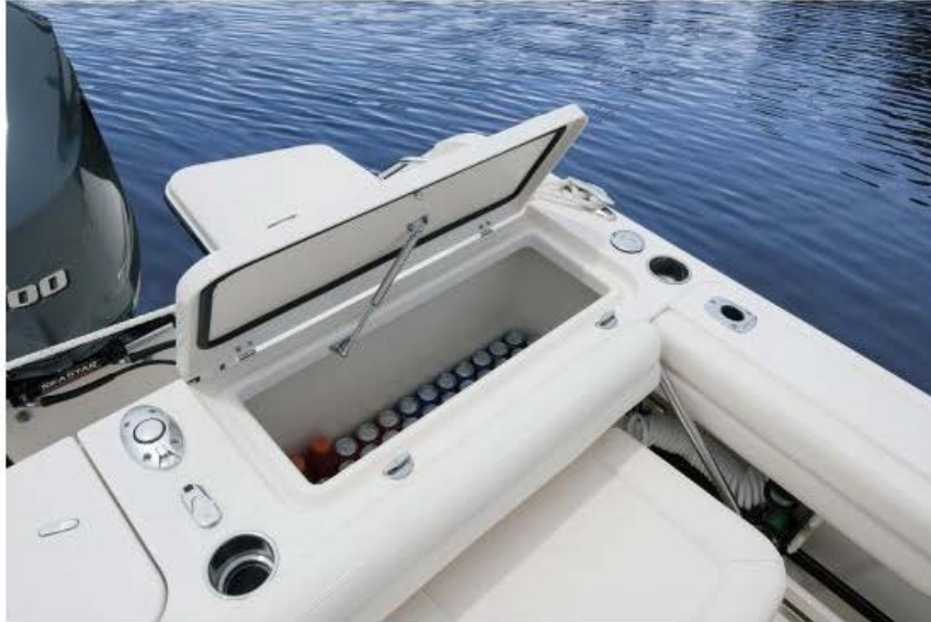
Transom fishbox that doubles as a cooler.

In the transom, she has a 160 quart insulated fishbox, which can also serve as a cooler, along with an optional 62 quart, insulated raw water lighted livewell, with a full column distribution inlet and overboard drain.