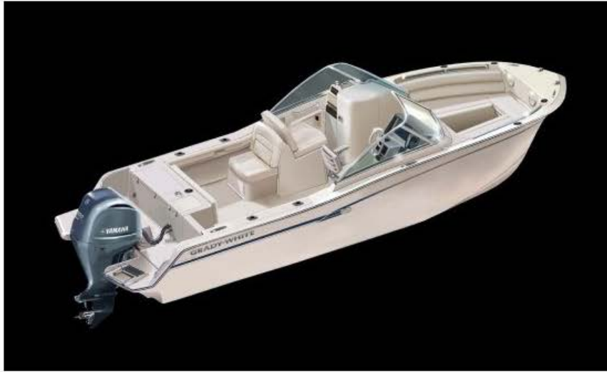
Concept isometric view of the Grady-White Freedom 235.