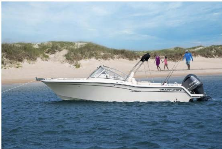
Grady-White's all new Freedom 235 has an LOA of 23'7" (7.18 m) and a beam of 8'6" (2.59 m).