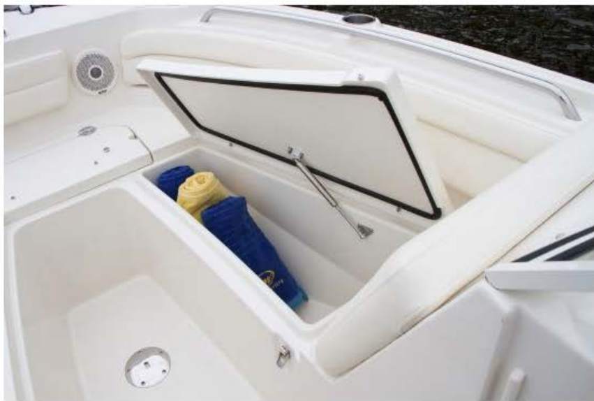
Storage locker to starboard is self-draining and can be used as a fishbox or a cooler.

The Freedom 235 is all about seating, and has a bowrider configuration, with port and starboard reclined seating. The port and starboard lounge seats are connected forward by an additional cushion, creating a U-shaped bench seat, which, when the padded insert is put into place, creates a sun pad. In addition, a table can be mounted in place creating a space for enjoying lunch and snacks at the bow. Below the forward cushion is access to the anchor locker. There is 22.25 gallons (84 L) of storage beneath each seat.