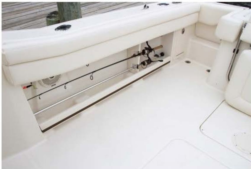
Shown are the rod holders. Note toe rail beneath.

Fishing remains a mainstay of the function of this dual console. She has four gunwale rod holders, two on each side, for trolling and the aforementioned retractable transom seat allows floor space to move freely about the aft cockpit, which has 25" of depth. Toe rails to port and starboard, below the three in-wall rod storage racks (six total), provide footing for leverage.