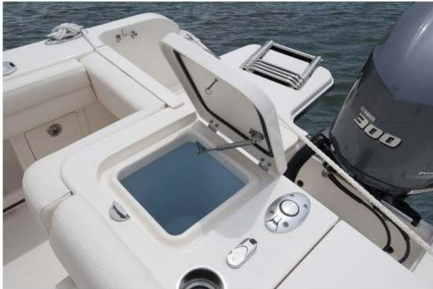
The livewell is offered as an option.

In addition there are two, port and starboard, downrigger ball/cup holders. The lockable starboard console compartment, which is lighted, houses a storage pocket and the tackle trays. The Freedom 235 is offered with an optional hardtop, and with this comes the additional option of either 15' (4.57 m) mounted crank or radial outriggers, along with four rod holders.