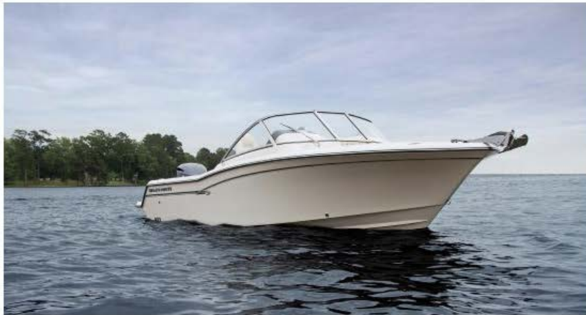
The Grady-White Freedom 235.