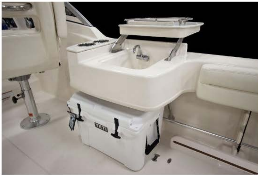
The optional wet bar with retractable cover and cutting board, sink and Yeti cooler beneath.

Sunset brings added enjoyment to the Freedom 235 experience with optional underwater lighting mounted beneath the swim platform. Blue courtesy lighting is also provided throughout the interior of the cockpit.