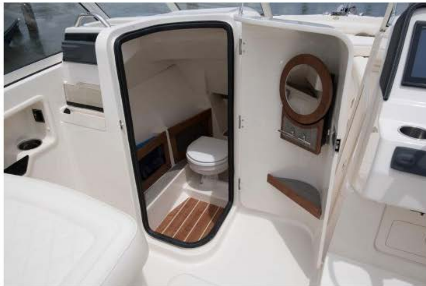
The head compartment of the Freedom 235.

The decking is teak and holly. As an added feature, there is a sola-tube above and to port which fills the space with natural light. An optional 10 gallon (38 L) holding tank is offered by Grady-White, to include a marine electric flush system, macerator and overboard discharge pump.