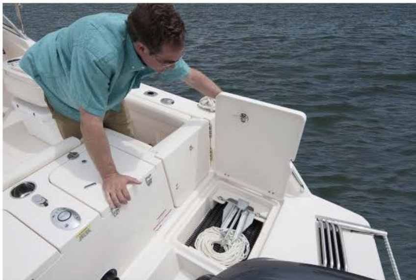
The starboard swim platform storage, housing a stern anchor, with matching storage to port. Never anchor from the stern offshore.

To starboard in the aft cockpit, is the optional feature of a wet bar, which includes a sink, with a retractable cutting board as its cover, and a Yeti cooler beneath. The Freedom 235 comes with a 20 gallon (76 L) fresh water tank and there is also a cockpit shower at the transom to starboard.