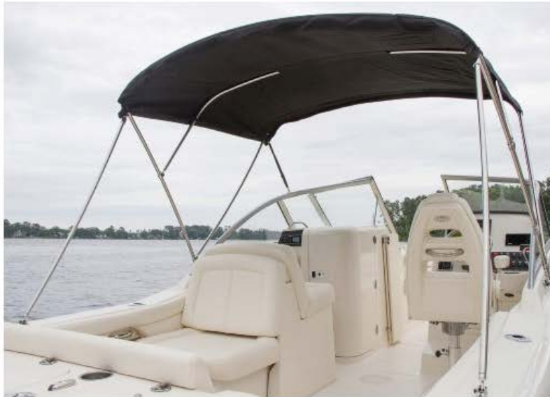
The aft cockpit arrangement.

Against the transom is a fold-away bench seat with backrest, that, when fishing, can be conveniently retracted against the transom bulkhead. When deployed, it can comfortably seat three. To include the helm, this rounds out a seating capacity onboard the Freedom 235 for nine passengers and her operator. The USCG capacity rating is for 10 people.