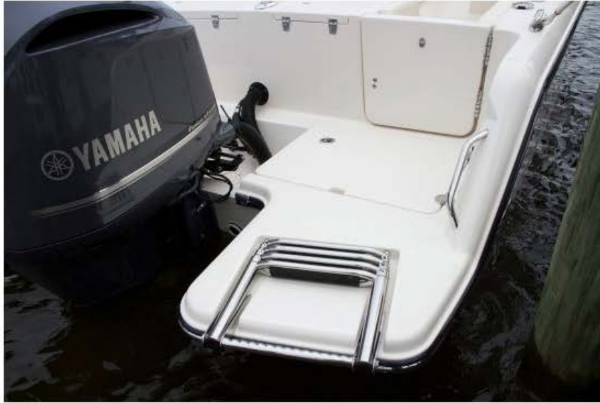
The telescoping four step swim ladder from the starboard platform.

There are two storage lockers in each side of the swim platform area, ideal for snorkel gear and an auxiliary stern anchor, which is useful when anchoring the boat astern to the beach to hold her into position. This of course should never be used as a primary anchor, and the boat should never be anchored solely from the stern offshore.