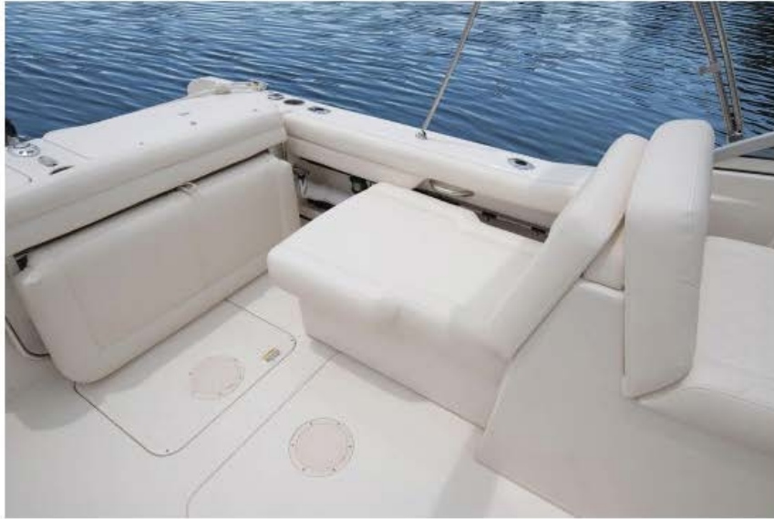
Aft seat in the chaise position. Note the retractable transom seat aft.