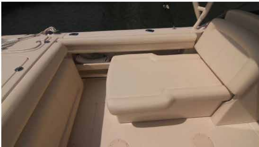
The cockpit comes standard with an electro-mechanically extendable, aft-facing lounge seat that mates with the transom seat back aft. Stereo remote controls are under the port gunwale. Plenty of rod holders, rod storage racks and cup holders are provided.