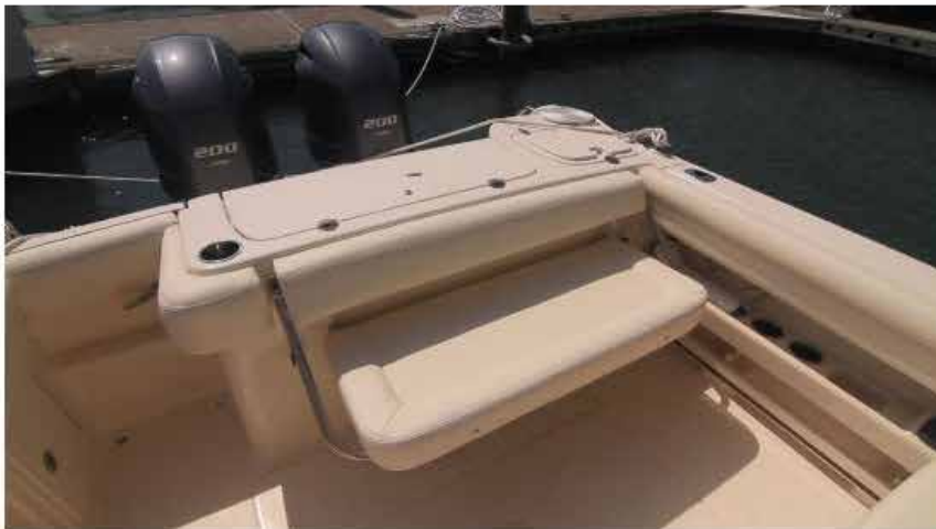
The transom seat folds up and down with little effort, built-in handholds are created by the end supports, and the seat itself is thickly cushioned and contoured for comfort and support. A big insulated fish or storage box (seen open here) and livewell to port, with a full-column distribution system for long bait life, is provided.