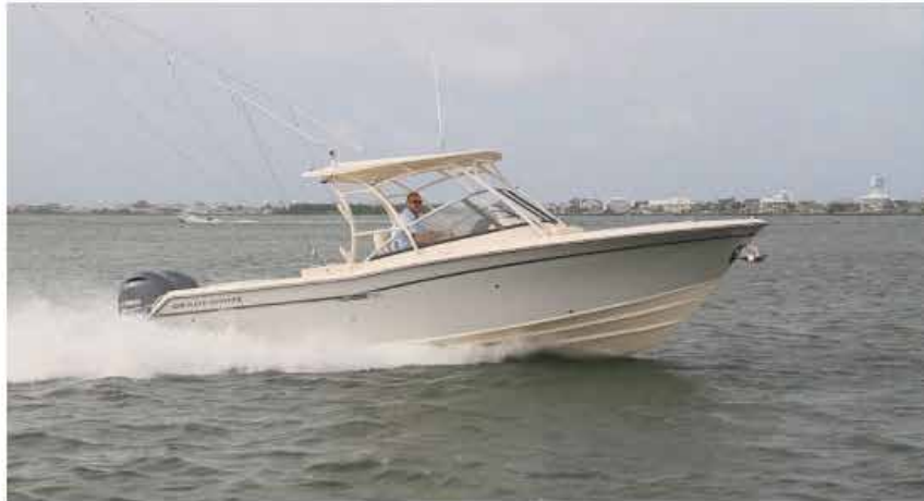
The Grady-White Freedom 275 has a length of 26'11" (8.20 m), a beam of 8'6", and a draft of 20" (0.51 m).