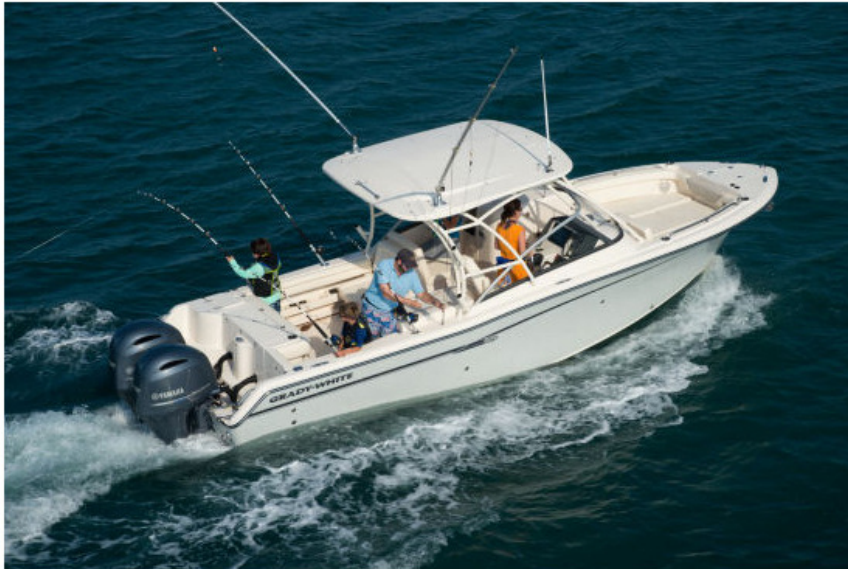
A bird's eye-view of the Freedom 275's fishing cockpit.