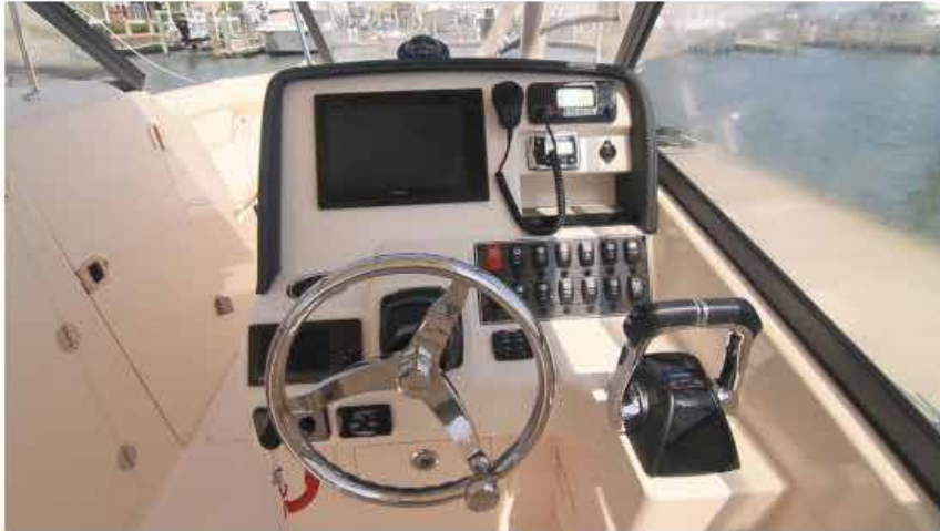
The helm supplies enough room for a single 15” display. The steering wheel and engine controls are comfortably situated.

The captain is treated to one other seat choice over the standard “Deluxe II” helm seat. This is important, not just because captains like to be comfy, but the entertainment console option(s) require certain helm seat upgrades in order to make it work in unison. Offered as a seating option is a command elite upgrade. The companion seat is well padded and incorporates a fold-down footrest, as well as having access to the port-side stereo system.