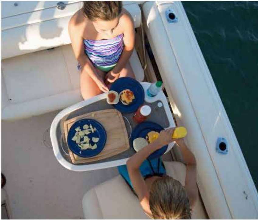
The removable bow table can also be used in the cockpit, as is shown here.