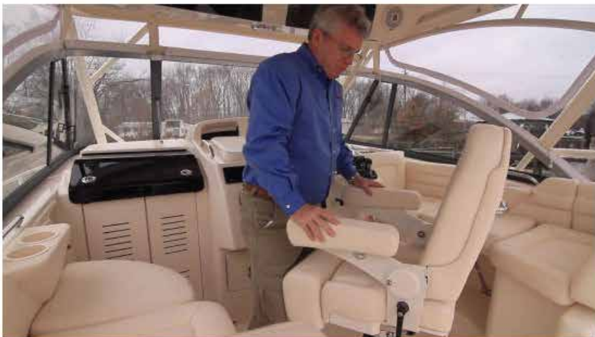
Our test boat was fitted with the Platinum Edition helm seat. It was fully adjustable fore and aft, up and down, included a flip-up bolster, flip-up armrests, and a reclining seatback.

Another slick idea is Grady-White's electromechanically operated electronics enclosure. This motorized dash console motors up to reveal all the boat's flat-panel monitors and electronic engine gauges, and closes to keep them secure and dry at the marina. As an option, the helm can be equipped with a 12,000 BTU air conditioning unit.