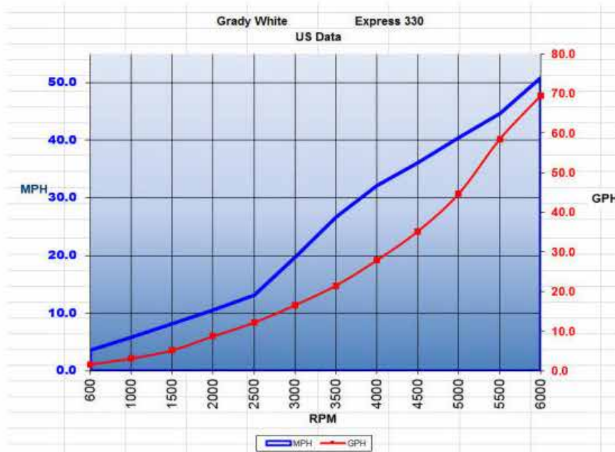
The efficient bottom design results in an almost linear performance curve. The blue line is mph and the red line is gph.