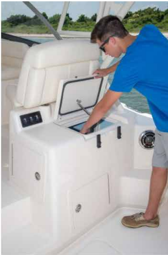
To starboard is a 45-gallon (170.3 L) livewell for keeping bait frisky.