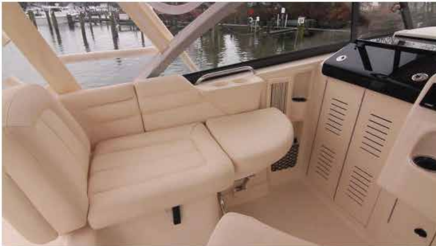
With the filler cushion in place, the port seating converts to a chaise lounge.