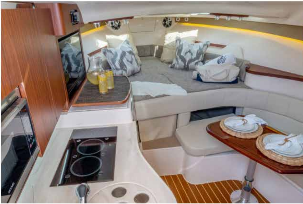
Looking forward from the companionway, we see the standard high-gloss cherry dining table and banquette seat, and the V-berth in the background with six rod racks on the overhead. The head is at right.