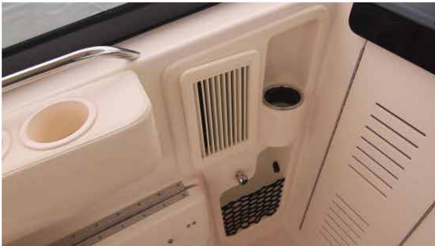
The storage nook in the port side coaming is handy for frequently used items. It includes a 12V power port. Above is a drink holder and a vent for the optional cockpit heat/air conditioning system.