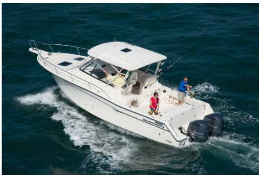
The Express 330 had a top speed of 50.9 mph at 6000 rpm, while burning 69.4 gph.