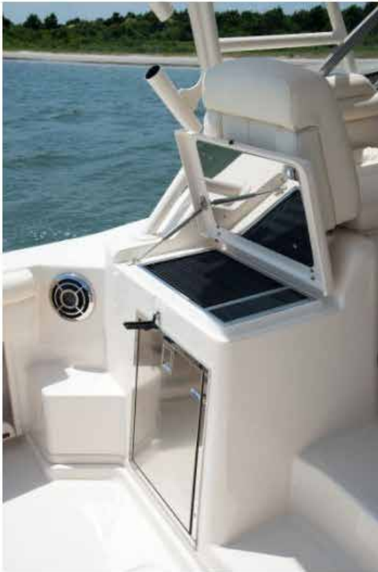
This optional 1300-watt electric grill and refrigerator converts the cockpit into a party zone. The center of the cockpit deck is reinforced to take a fighting chair.

Forward in the cockpit, on the port side, is a rigging station with a sink and storage space for tackle in the locker below. This workstation can be reconfigured to provide a large electric grill up top and a stainless fridge below. This is a good option for entertaining. Directly across to the starboard side is another console that houses the Express 330's 45-gallon (170.3 L) raw water livewell with light, overboard drain, and full-column distribution inlet.