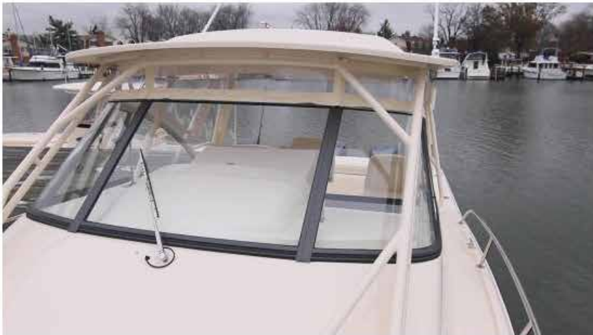
The Grady-White Express 330's standard hardtop adds important utility. It has an overhead hatch that is low-profile acrylic. The top of the unit has six molded-in pads for gear, spreader lights, six rod holders and a storage net aft is ideal for life vests. A cockpit awning extension is optional.