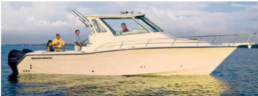
We think this optional enclosed helm adds tremendous utility to this bluewater express.