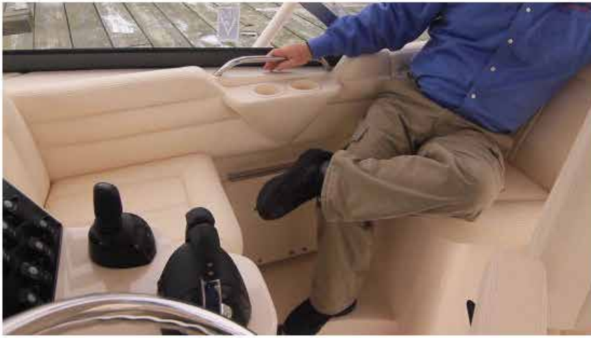
To starboard of the centerline helm chair are two seats facing each other.