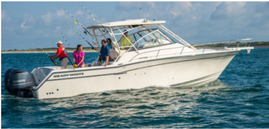
The Express 330 with standard hardtop provides shade as well as an electronics box, lights and 6 rod holders.

By rigging the boat with many important amenities as standard equipment, the boat is ready for a serious fishing expedition or a long-range cruise, right from the showroom floor. For that reason, we suspect the buyers of the Express 330 are about 50/50 serious anglers/veteran cruising couples. By having a standard generator, A/C, and water heater, in addition to full galley appliances, the boat provides the comfort necessary to keep the whole family happy.