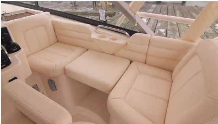
The seating easily converts to a lounge that can be used by a guest-facing either forward or aft.