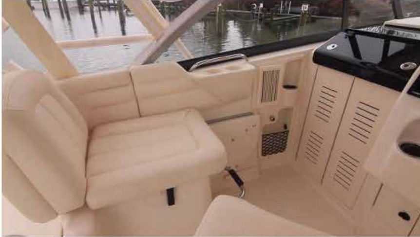
Here the port side seating can be seen in the traditional forward-facing configuration.

Located on the port side is a traditional seat for one that easily converts into a mini-lounger. This location also provides access to the companionway's folding doors and the cabin below. Under the seat is a 56-quart (53 L) cooler. When the port side seat was reconfigured, it allowed easier passage through to the cabin entrance and more luxurious seat cushions throughout the helm and all seating areas.