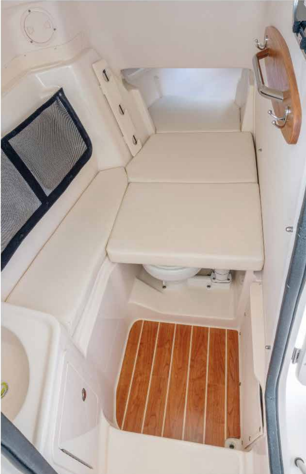
The cabin in the port console of the Freedom 307 holds a marine head with holding tank. A fold down berth offers a quick spot to lay down below decks. The cabin can be equipped with air conditioning.

There is a small cabin space in the port console with a standard marine head, holding tank and sink. A fold-down berth offers a quick spot to lie down. The berth is large enough for one adult. A 3,500 BTU air conditioning option can be ordered for the cabin. The air conditioning, grill, and refrigerator all require a shore power connection.