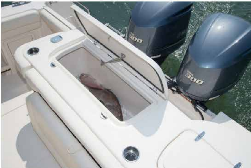
Twin 300 Yamaha outboard engines power the Freedom 307. The integrated bracket provides a stable platform for entering the boat from the water. The insulated transom box can hold fish, iced beverages, or can be used as dry storage.

We have not tested the Freedom 307 but the folks at Grady-White and Yamaha have. The twin 4.2-liter six-cylinder F300 engines had the best cruise at 1.58 statute miles per gallon at 3500 RPM going 27.9 mph. Top speed is reported to be 50.2 mph.