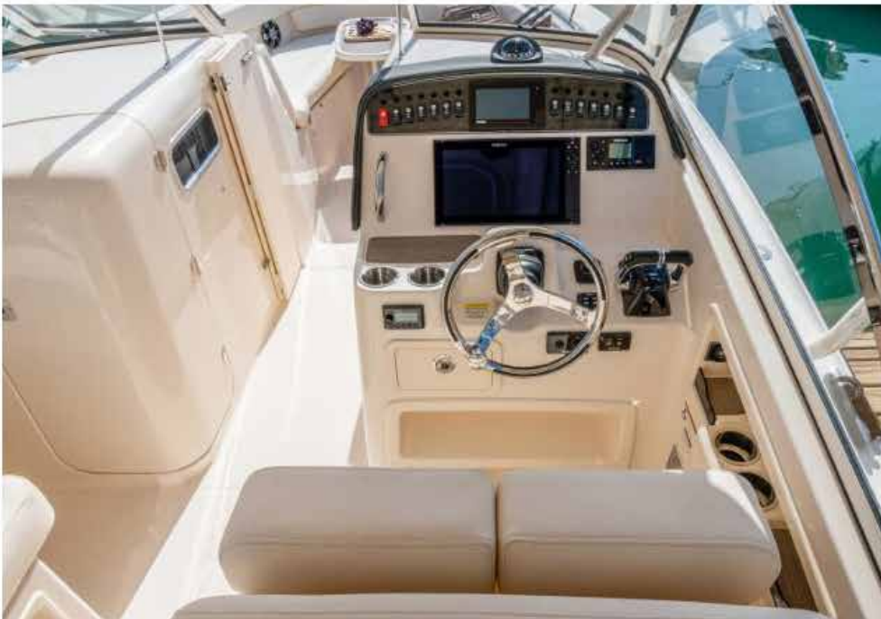
The Freedom 307's helm is large and comfortable. The cushioned helm seat is wide enough for two and adjusts forward and back electrically. Note the two footrests in the console.