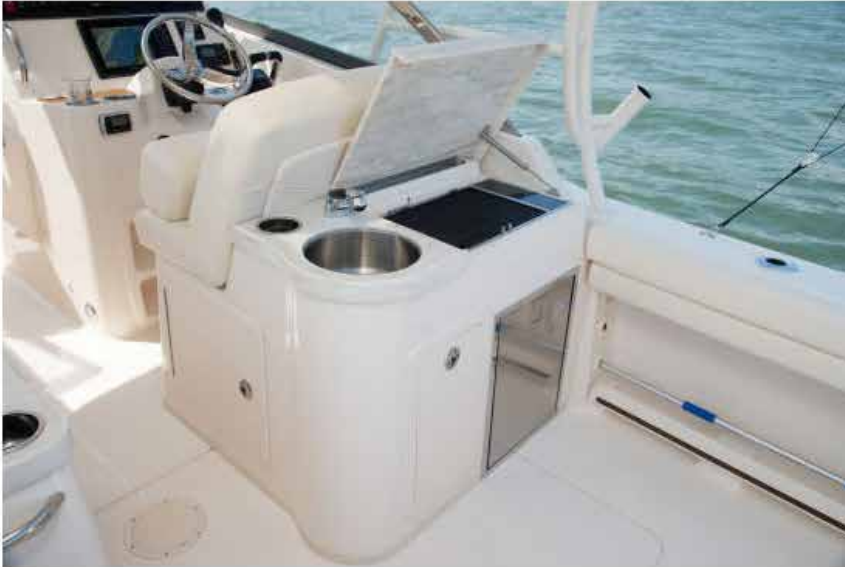
The starboard wet bar with the optional grill and refrigerator add entertaining functionality aboard the Freedom 307.

The Freedom 307 is a day boat built for full family function, including entertaining. Thoughtful factory options can focus the 307 on how owners plan to use their boat. For example, the standard wet bar behind the helm seat comes with a freshwater sink and three deep storage drawers. But if entertaining is the goal, an electric grill can be added as well as a refrigerator instead of the standard drawers.