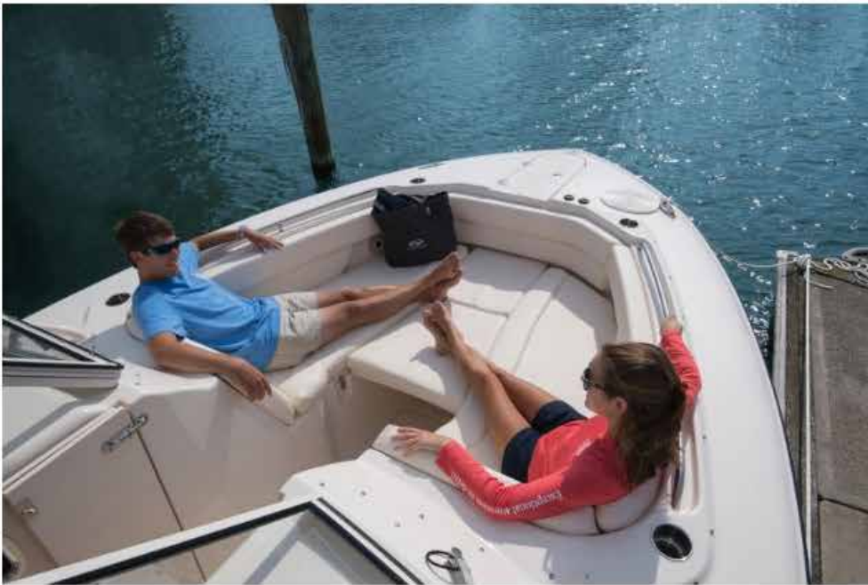
An optional filler cushion in the bow creates a huge sun pad playpen for sun worshipers.