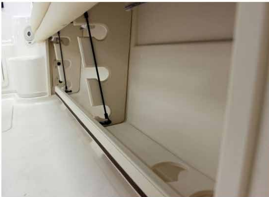
A view of the Express 370's rod storage, the toe rails at the bottom, and the cockpit bolsters just at the top.

The cockpit is a largely open space with one non-intrusive seating bench (that can be folded up and out of the way), and nothing but small fishing-focused amenities to come between a guest and the hunt. Access to the seacock levers and the standard 8 kW generator are found aft and below the bench. To port and starboard on the aft end of the cockpit are dedicated rod storage racks, three to a side, with bolsters above and toe rails below. Along the top of the gunwales are stainless steel rod holders, two to each side.