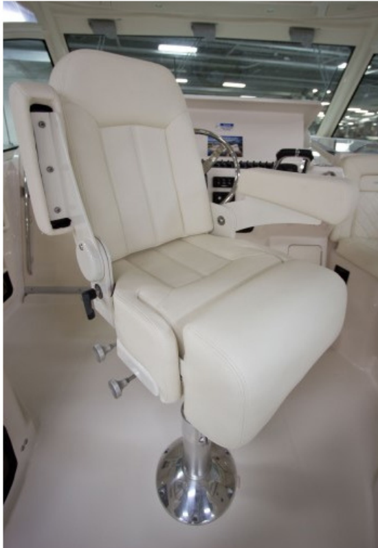
A look at the Deluxe platinum helm seat on the Express 370, which can adjust horizontally and vertically and up and down with armrests and bolsters.

Cockpit/ Helm Divide Design. The Express 370 has an interesting design moving from the cockpit to the helm—the cockpit acts primarily as a fishing space, with a spare, open design surrounded by fishing amenities. Moving forward toward the helm is up two fiberglass steps, under the boat's standard hardtop.