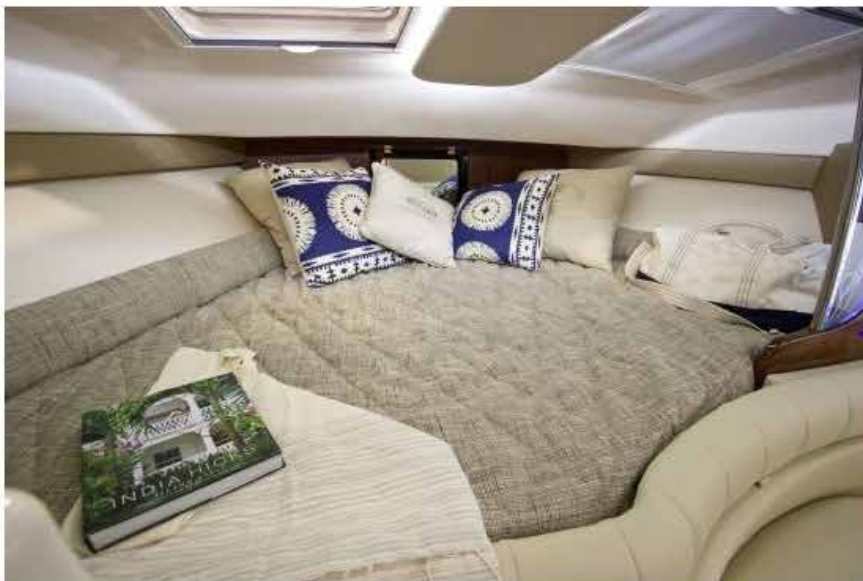
The forward vee-berth. Note the hatches above, both of which open and can be outfitted with screens and covers depending on need.

The table can adjust down, with a filler cushion added to convert this space to a third berth.