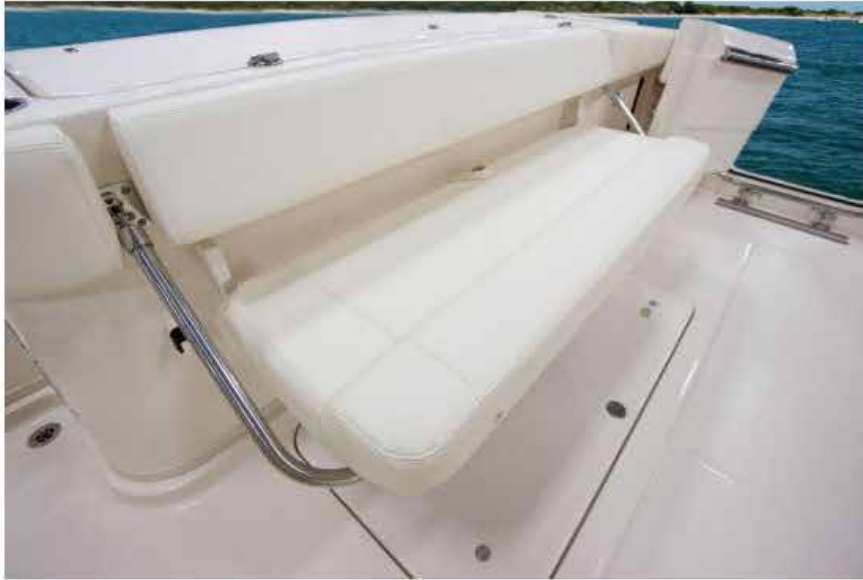
The aft transom seat on the Express 370, which can fold down or up and out of the way.

The cockpit is a largely open space with one non-intrusive seating bench (that can be folded up and out of the way), and nothing but small fishing-focused amenities to come between a guest and the hunt. Access to the seacock levers and the standard 8 kW generator are found aft and below the bench. To port and starboard on the aft end of the cockpit are dedicated rod storage racks, three to a side, with bolsters above and toe rails below. Along the top of the gunwales are stainless steel rod holders, two to each side.