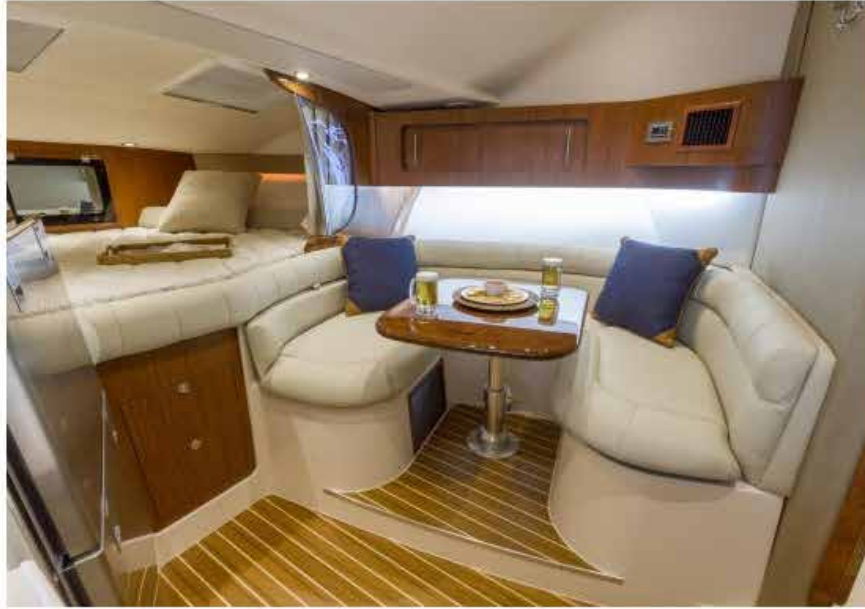
The dinette on the lower deck. Note the teak and holly sole, which comes standard, as well as the A/C panel near the overhead storage.

Dining Section. Back outside the head, the starboard side of the lower deck is occupied by a large dining section. The premium vinyl-upholstered U-shaped seating space wraps around a high-gloss cherry wood table with an adjustable stainless steel pedestal. Just above the dining section are further wood cabinets in the same style as the galley on the port side—sliding wood doors with stainless steel handles.