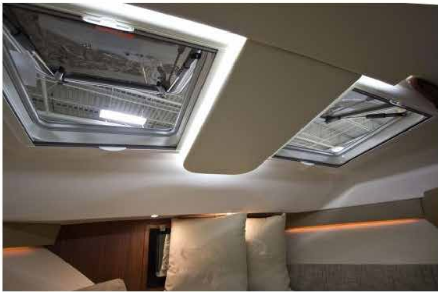
A closer look at the opening overhead hatches on the Express 370.

Forward Berth. The forward end of the lower deck is the v-berth, elevated above the level of the dining space. The berth has a mattress that can easily lift up to reveal storage cubbies. Further, the space between the refrigerator to port and starboard dining section starboard is storage in the form of cherry wood drawers.