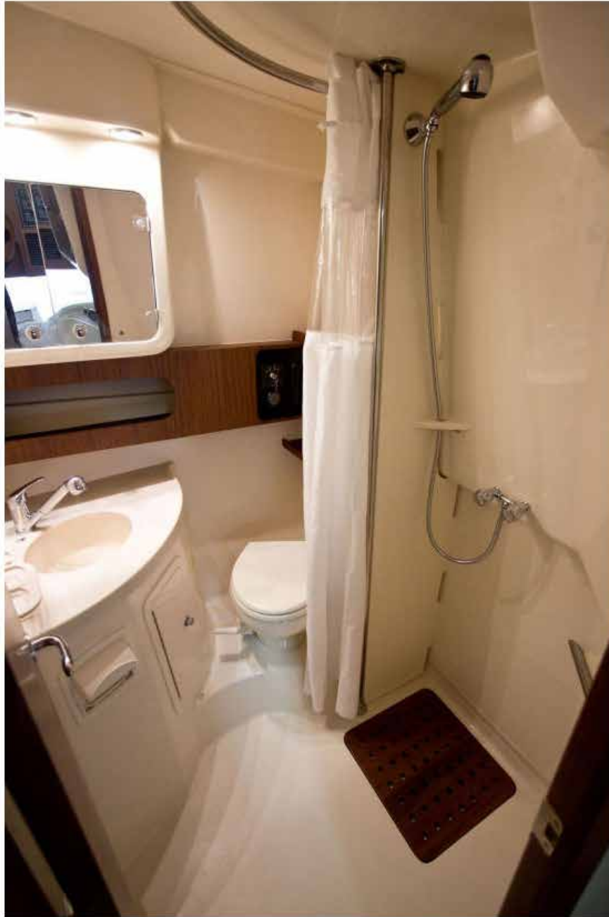
The head on the Express 370. Note the shower stall, the mirrored storage, and the faucet and sink.

The Head. Back up and outside the berth, further starboard, is the head. The head is behind a solid door with stainless steel handle and a full-size mirror on the inside. The head is ventilated, and has a sink with Corian countertop, a full shower, mirror doors on a storage cabinet, two cherry wood shelves above the head, and a VacuFlush marine head with an 18 gallon (68 L) holding tank.