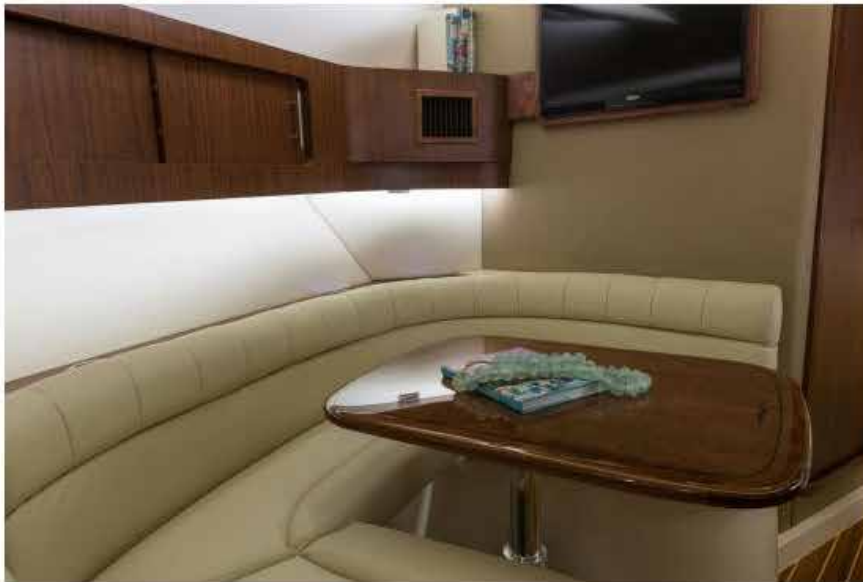
A view of the dinette, converted to a berth and in its natural state, with the cherry table.

The table can adjust down, with a filler cushion added to convert this space to a third berth.