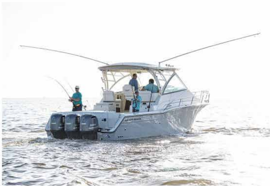
The Grady-White Express 370 is a great ride and a premium fishing vessel with accommodations for a long trip.

The fishing spaces are nicely thought-out, with an array of amenities toward that activity close at hand. The luxury elements include an impressive array of features throughout the boat.