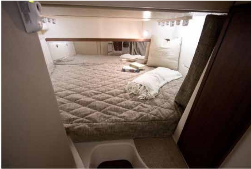
The aft berth on the Express 370, which is a double-sized mattress. Note the rod racks overhead.

the Express 370 has a sink and faucet, Corian countertop, cutting board, Kenyon electric glass stovetop, and storage cabinets above. The wood cabinet panel has two sliding wood doors, as well as a stereo control panel and a microwave. Below the microwave in the bulkhead are a refrigerator and freezer via stainless steel drawers. The freezer comes with a built-in icemaker.