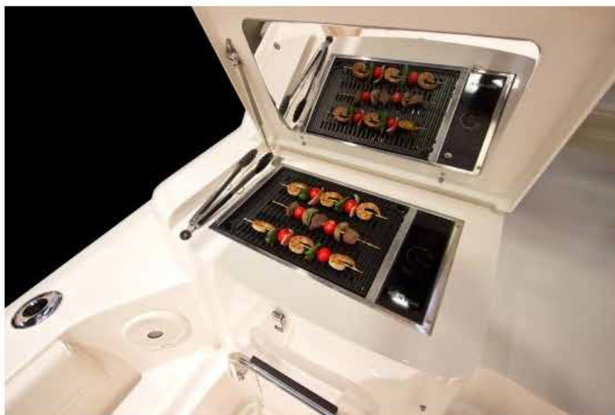
The grill station on the Grady-White Express 370 is to port on the forward end of the cockpit, just near the steps up to the helm.

The decks are non-skid surface, with the remainder of the surfaces molded-in fiberglass. To starboard forward the rod storage is a rigging station, comfortably removed from the main fishing "pit" in the Express 370, but easy to reach when needed. The rigging station has a freshwater sink with pullout faucet and 48 gallon (181.7 L) livewell under latched lids. Beneath the insulated boxes are two hinged storage compartments one with four removable tackle trays and the other a fishing tools holder (knife, pliers, etc.) both are lockable. The livewell has a full column distribution inlet, a light, and (like all other insulated boxes on this Grady-White) an overboard drain.