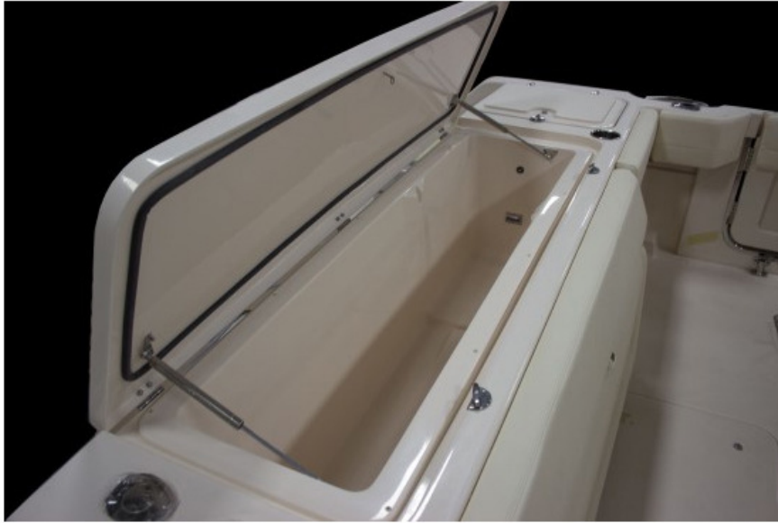
The aft fishbox, situated along the transom. Note the fold-down transom seat just to the right of the frame.

The Express 370 comes standard with triple 300 Yamaha four-strokes and offers an option of triple 350s. A telescoping reboarding ladder is molded into deck space and is to the starboard side, right in line with the transom walk-through door also to starboard. The inside edge of the solid transom door has a plush bolster, which extends from the bolster on the gunwales in the cockpit. The robust door is made of fiberglass and has a stainless steel latch just under the bolster.