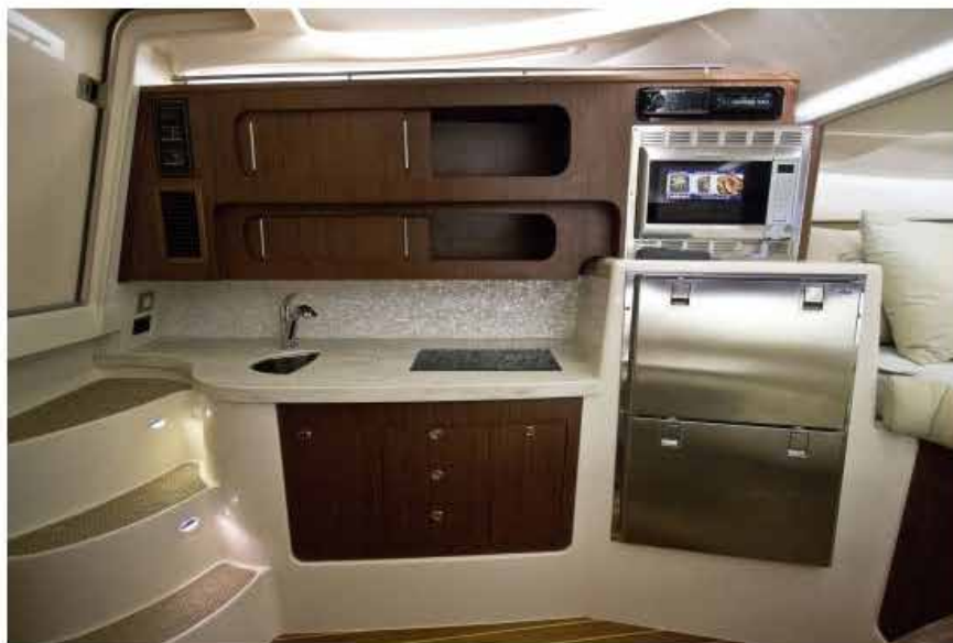
The Express 370's galley, with refrigerator, freezer, microwave, and overhead storage.

Access to the lower deck is on the port side of the helm section, down three steps with non-skid surface. The lower deck has a teak and holly sole.