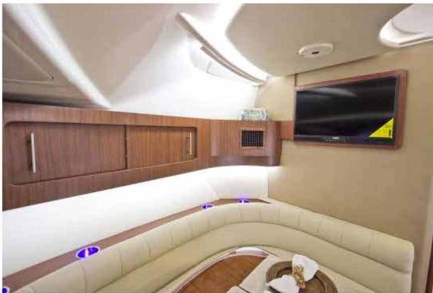
The HDTV on the lower deck comes standard with the Express 370.

Overhead in the forward berth are two opening portlight hatches, and leading into the berth is a stylish piece of etched glass installed in the wood bulkhead.