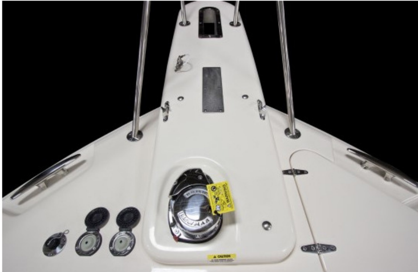
A view of the bow pulpit with windlass, foot controls, and roller for the anchor. The anchor storage hatch is on the starboard side.

Moving up via the side decks on the Express 370 with help from the heavy-duty 316 grade stainless steel guiderails. The forepeak has a stainless steel windlass, which feeds the bow pulpit, which has a roller. Windlass foot controls are to port, with anchor rode storage locker under a hatch to starboard. Further windlass controls come at the helm.