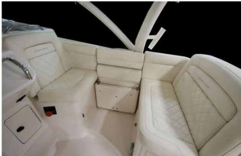
The versatile starboard helm seating, with its many configurations seen here.

To starboard is a versatile seating space, with a double-wide forward facing bench seat facing an aft-facing single seat. In between, on the bulkhead, is a fold-away table with cup holders molded-in that can lower and support a filler cushion that can turn the seating into a U-shaped lounge. More storage comes via drawers below the forward-facing seat.