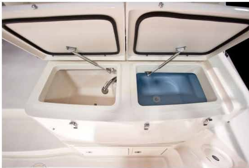
The rigging station to starboard in the Express 370's cockpit. Note the sink, livewell, and latched storage below.

The decks are non-skid surface, with the remainder of the surfaces molded-in fiberglass. To starboard forward the rod storage is a rigging station, comfortably removed from the main fishing "pit" in the Express 370, but easy to reach when needed. The rigging station has a freshwater sink with pullout faucet and 48 gallon (181.7 L) livewell under latched lids. Beneath the insulated boxes are two hinged storage compartments one with four removable tackle trays and the other a fishing tools holder (knife, pliers, etc.) both are lockable. The livewell has a full column distribution inlet, a light, and (like all other insulated boxes on this Grady-White) an overboard drain.