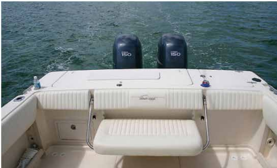
The patented seat across the back that stows away or sets up in seconds.

transom mount for the single 350-hp Yamaha available for this rig. You might think that is overkill, but if you are serious about going off-shore, it's going to get you there like a bullet. If you prefer twins, you can rig her up with dual 150s or 200s. Standard single rigging is for a single 250. If the boater does more than fish, they will likely want the optional small or full-sized swim platform with ladder. Four flush-mount vertical rod holders are in the gunwale tops, and six more stored in the under gunwale racks with safety toe rail to lock yourself onboard when reaching overboard. A monster insulated fishbox measuring 297 quarts and a cutting board is there right where one would need them. Below the helm is another 265-quart fishbox with the 36-gallon livewell across the cockpit under the navigator's station. This livewell is a full column, raw water lighted and insulated box with overboard drain and 1100 gph pump.