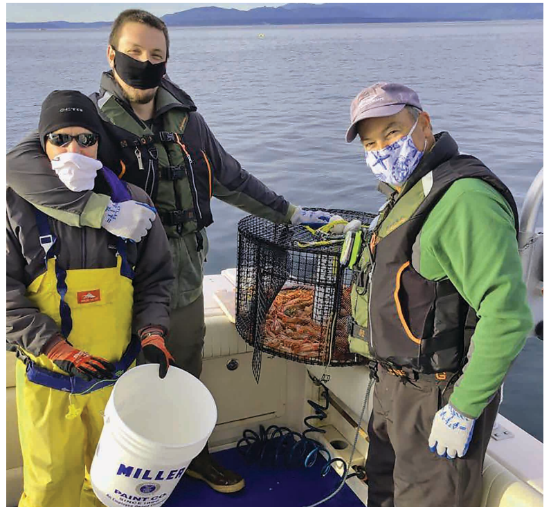
The Northwest Grady Club didn't let a pandemic get in the way of shrimping!