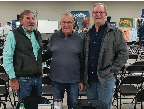
The Low Country Grady-White Club attended a Tackle and Tactics seminar at the Boathouse in Hilton Head, SC.