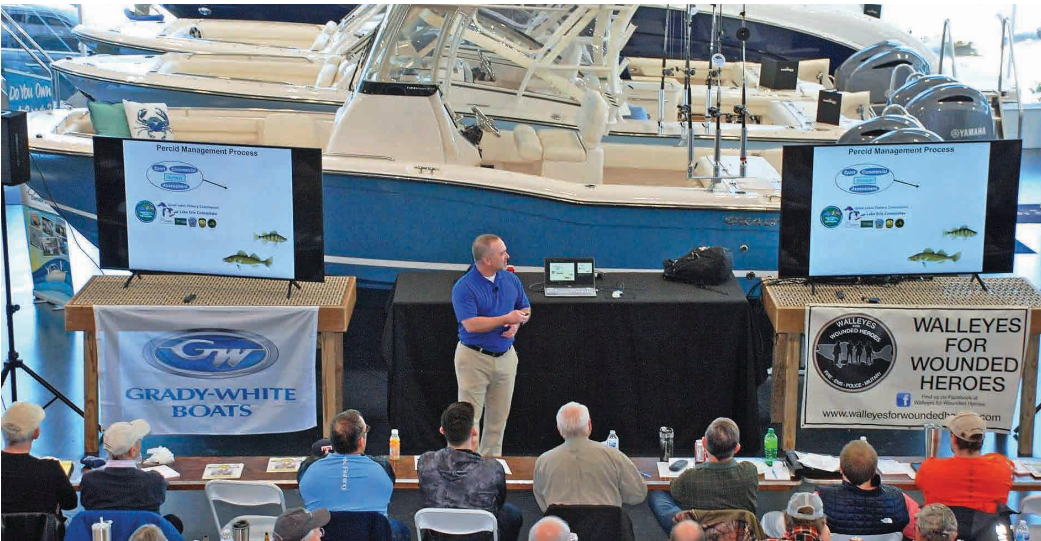
The Lake Erie Grady-White Club, along with South Shore Marine, hosted presentations from Walleye Pros for more than 221 attendees and volunteers on March 7th. A collection of at-the-door donations and raffles raised more than $9,830 for the Walleyes for Wounded Heroes and Youth Challenge.