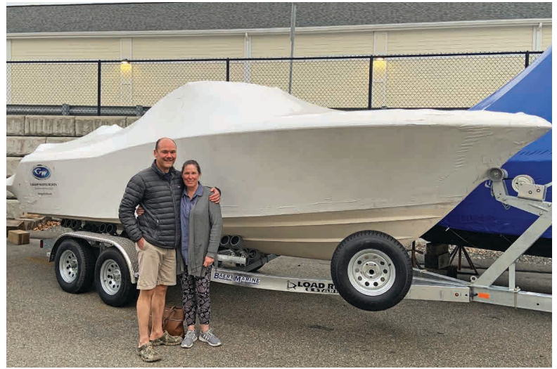
The Drohosky family was so happy to climb aboard their new 2020 Grady-White Freedom 215 for the first time. In February, they visited Grady-White to see their boat on the production line.