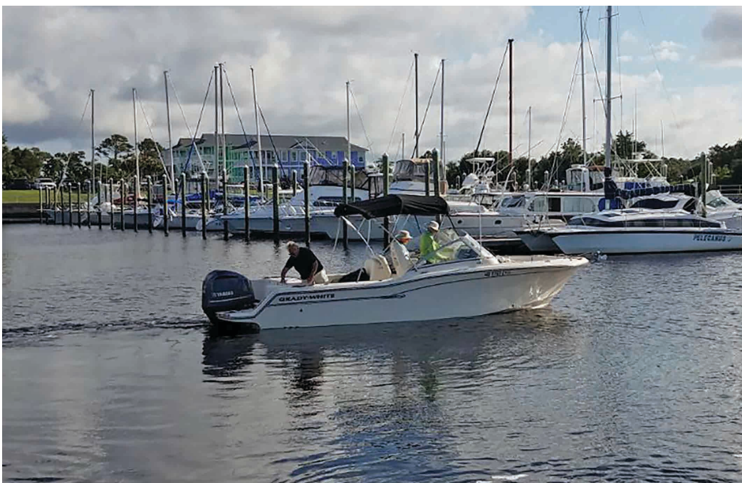
The crew departs a dock in Southport, NC, to continue their trip along the Intracoastal Waterway in Libby's third Grady-White, a Freedom 235 .