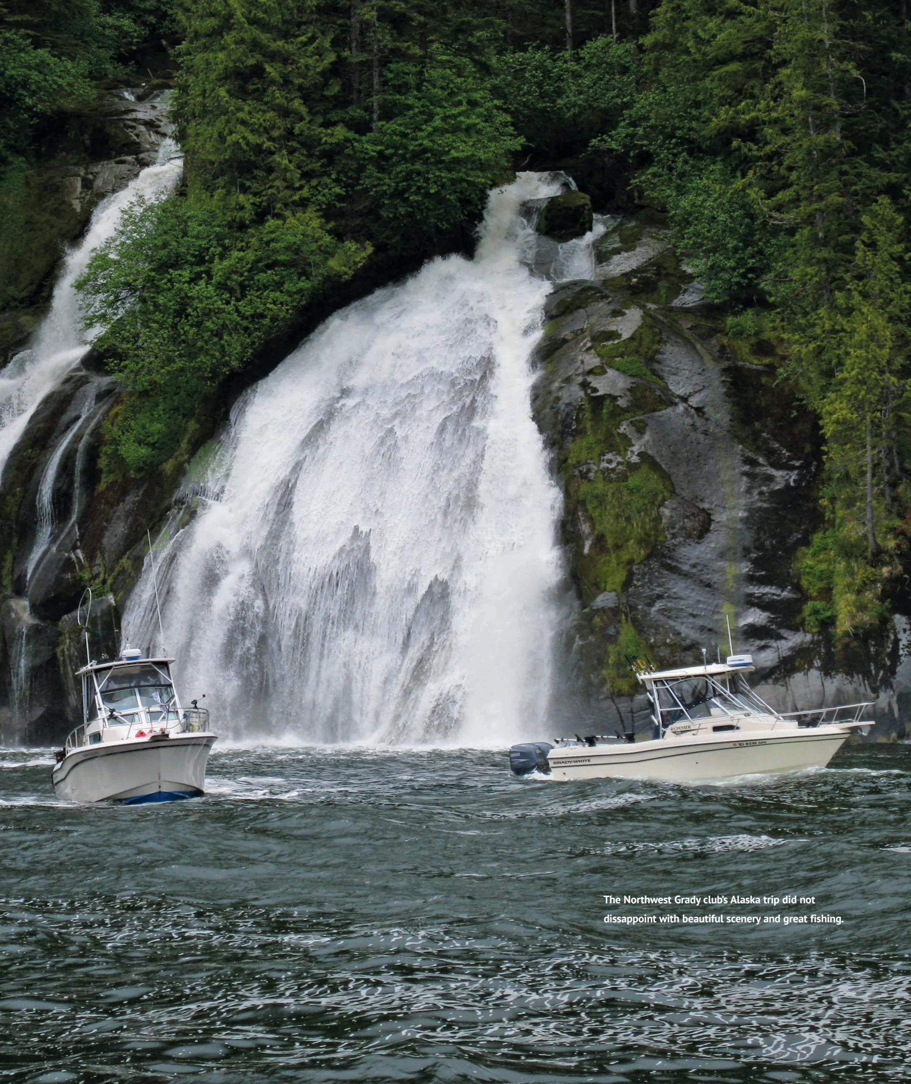
The Northwest Grady club's Alaska trip did not dissappoint with beautiful scenery and great fishing.