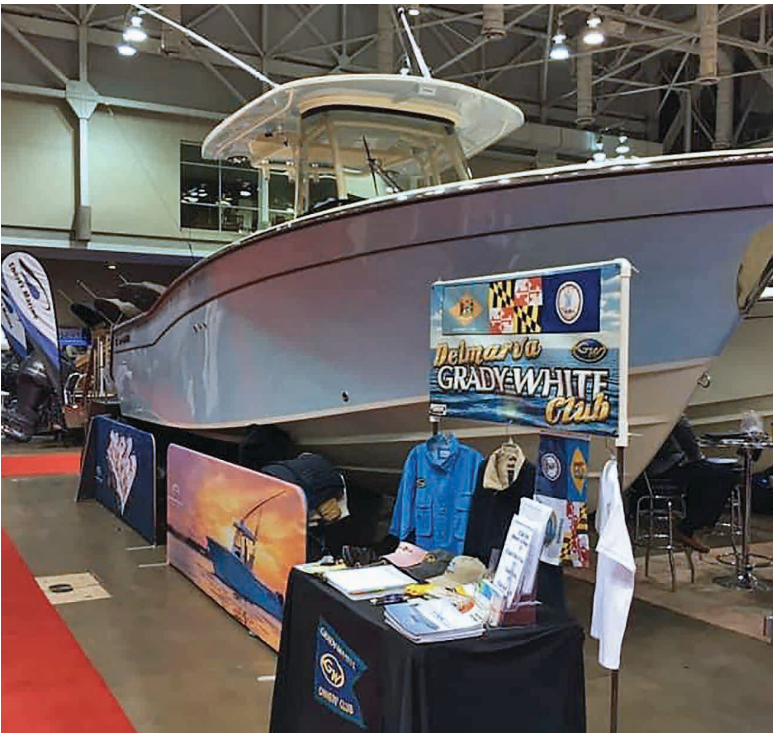
The Delmarva Grady-White Club promotes the many benefits of club membership alongside this beautiful Grady at a boat show earlier this year.