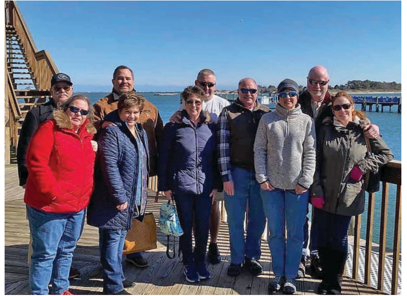
The Chesapeake Bay Grady-White Club enjoyed lunch at The Shark on the Harbor and the Atlantic Marine Store in Ocean City, MD, in early March.