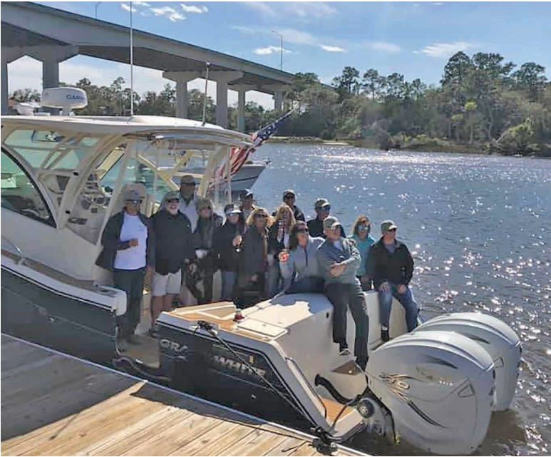
The First Coast Grady-White Club met in February at Palm Valley Outdoors in Jacksonville, FL, to enjoy good food, great people, and time on the water.