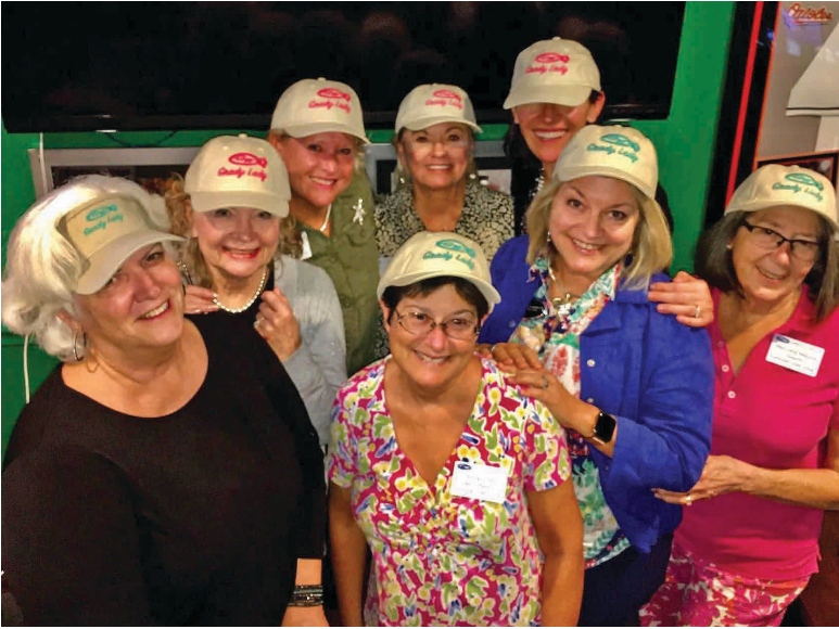
The ladies of the Gulfstream Grady Group show off their pride in living the Grady Life with their own line of "Grady Lady" hats and visors!

Here are highlights from recent Grady Owners' Clubs events and outings. If you have Grady club information to share or are interested in Grady clubs in your area, email anchorline@gradywhite.com . Go to gradywhite.com for links to club websites.