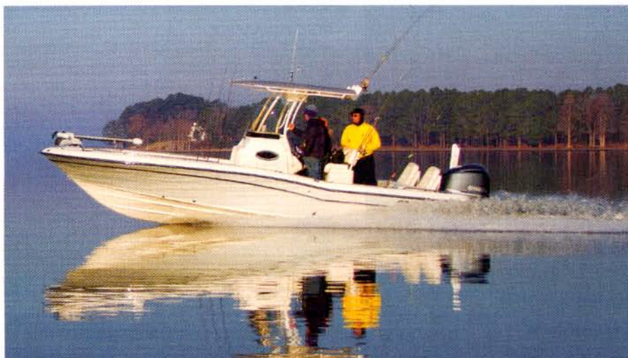
ABOVE: On a glass-calm Pamlico River, the 251 makes a quick run to the fishing grounds, topping out fully loaded at about 46 mph. TOP RIGHT: Aft transom seating lifts to reveal a 12 \frac{3}{4} -gallon livewell and storage. RIGHT: The author nabbed a few of the hybrid striped bass too!