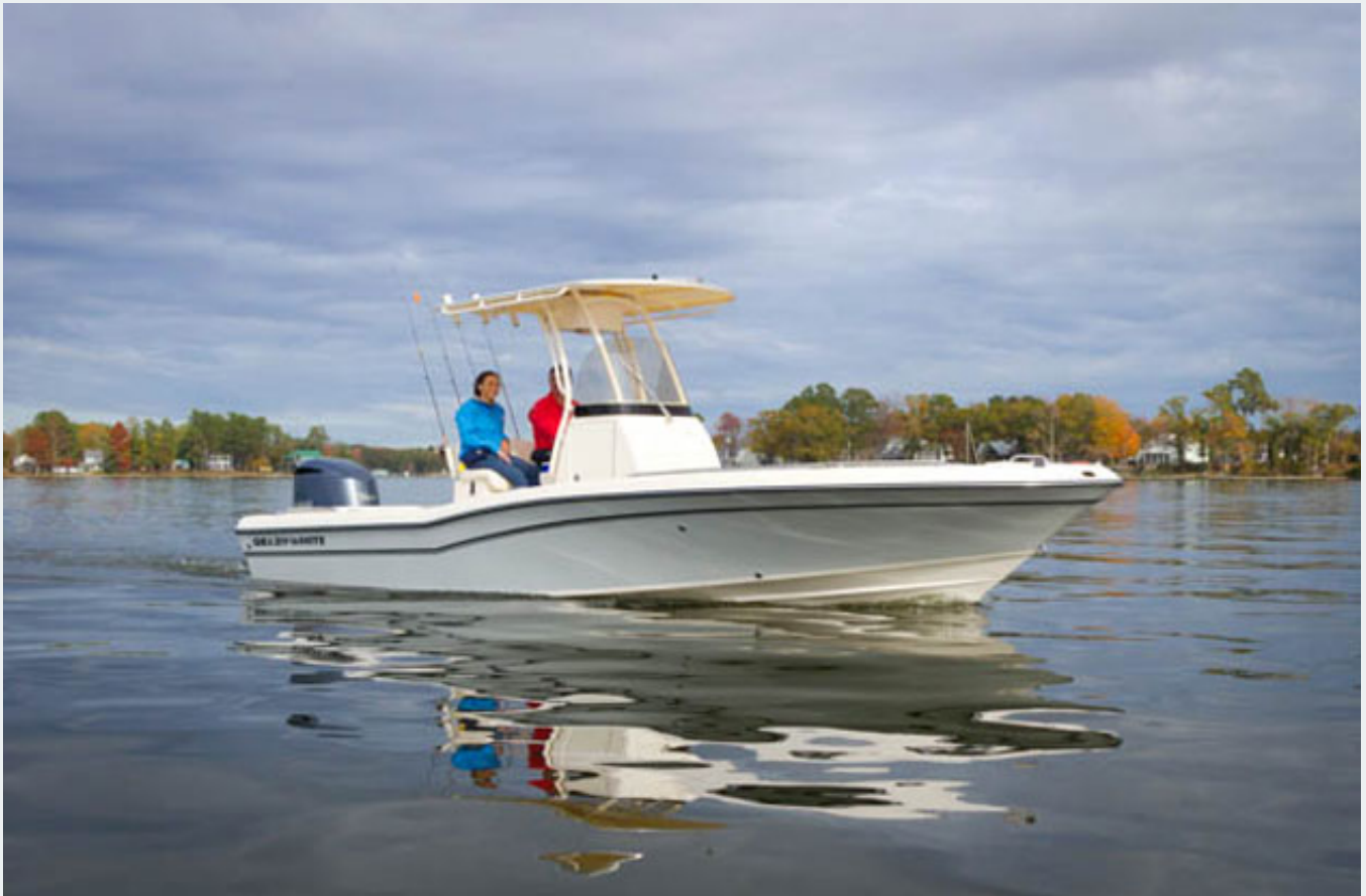
Grady-White goes bay boat, with the 251 Coastal Explorer.

Bay boats have become amazingly popular over the past decade, and with the 251 Coastal Explorer, Grady-White has entered the fray. This marks a new direction for this well-known builder, which has spent the past few years developing its line of large dual console cruisers, like the Freedom 335 . And it's a direction we anglers in search of finning redfish and hungry speckled sea trout like.