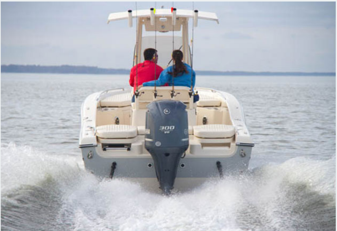
A view of the 251 Coastal Explorer from the stern tells you something else about this boat.

Bay boats have to walk a narrow line; shallow draft is important so you can sneak into back-country channels and cuts, but the hull needs enough V (which increases draft) to smooth out the ride. Fore and aft casting decks are imperative, but everyone still wants enough seating to take the entire family for a ride. And low sides are a must for easily landing the fish, but if they're too low, you won't be able to pop through the inlet for an oceanic adventure when the weather allows. In short, bay boats are a case study in boat design compromises, and looking at the 251 Coastal Explorer from a few different angles helps you understand how and where Grady-White's designers made those compromises to create a big, beefy bay boat that can still get into and out of the shallows. First, consider the side profile above. Note that the aft gunwales sit rather high for a bay boat, and the bow is even higher. Clearly, Grady-White tilted towards big-water seakeeping abilities in this regard. Yes, you will have to lean a bit farther to scoop a fish with the net, or lift a little higher to swing a fish over the gunwales. But on the flip side you won't hesitate to run this boat offshore, which plenty of bay boats with very low profiles simply aren't capable of.