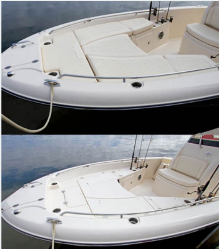
The bowdeck of the 251 CE, in both cushioned and fishing-ready incarnations, with the filler platform in place.

The only real down-side to this arrangement is that you'll have to do some prep work prior to your trip to convert the 251 from a die-hard angling machine into a family cruiser, or vice-versa. No biggie—I went through the entire process, and it took about 10 minutes.