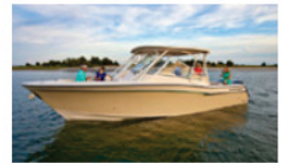
Freedom 335 (2013-)