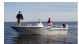
191 CE (2015-)