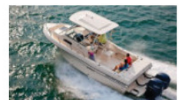
Gulfstream 232 (2015-)