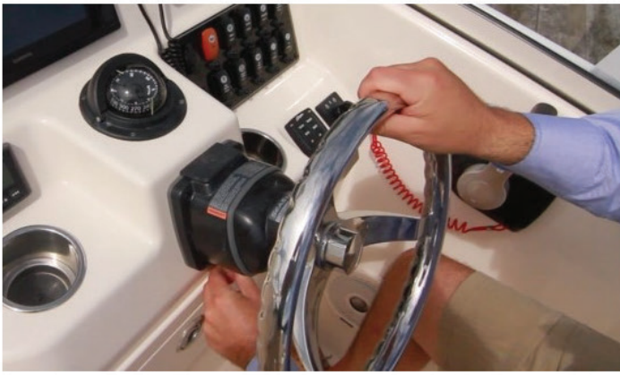
The hydraulic steering and tilt wheel are standard features on the Freedom 215. The 316-grade steering wheel comes with a knob standard.