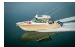
Freedom 375 (2015-)