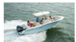
Fisherman 236 (2016-)