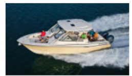
Freedom 335 (2015-)