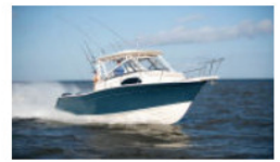
Marlin 300 (2017-)

Conditions: 80 degrees, light wind (5 mph), light chop