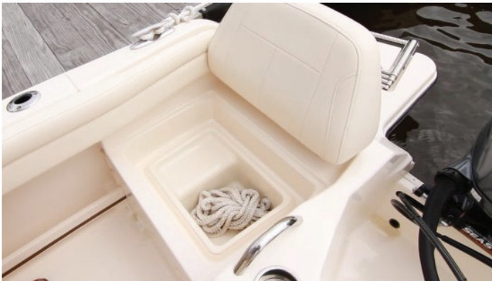
A removable storage box is inside each of the two aft seats