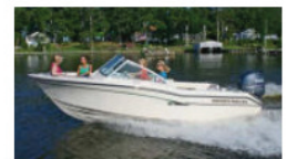
Freedom 192 (2015-)