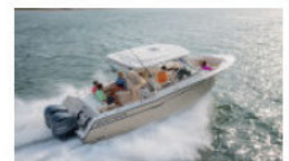
Freedom 307 (2015-)