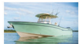
Canyon 306 (2017-)