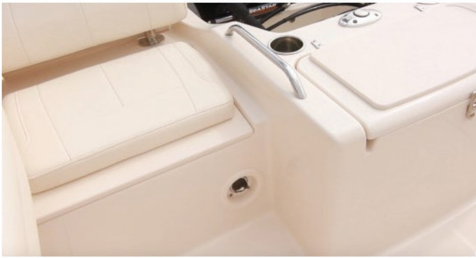
The battery switch is recessed into the starboard side aft seat for easy access.