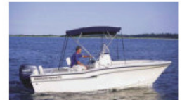
180 Fisherman (2011-)