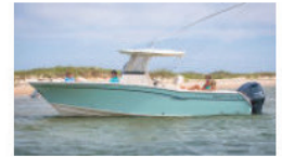
Canyon 271 FS (2016-)