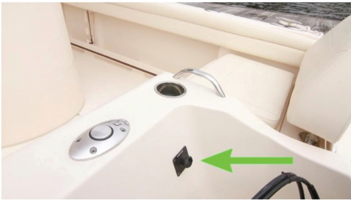
The test boat came with the optional engine flush system. The hose attachment is on the outboard side of the transom.