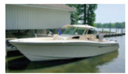
Canyon 366 (2009-)