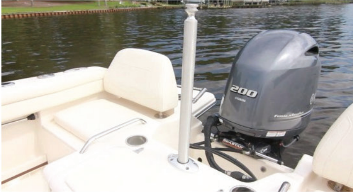
The optional tow pylon pops up and is great for families that enjoy tow-sports.