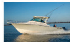
Express 370 (2017-)

Shown here with the optional Sun Platform insert.