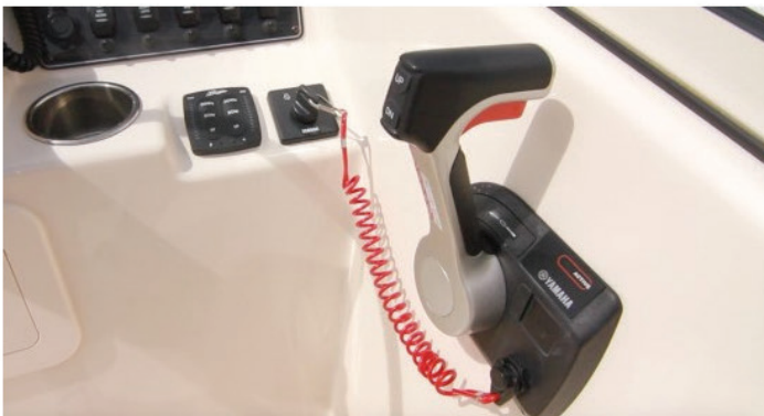
The cup holder and ignition switch are standard; the trim tabs are an option from Grady-White. The test boat's trim tab controls are well placed at the top of the throttle throw.