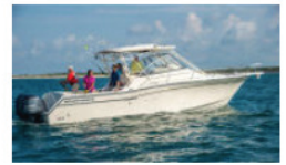
Express 330 (2015-)