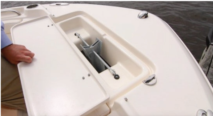
The anchor locker has a latch to keep the lid from opening while underway and deep drain gutters to keep water out of the locker.