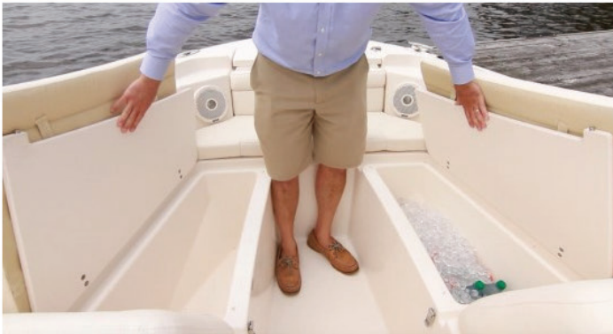
Port and starboard insulated storage can double as fish boxes or coolers with overboard drains. With the cushions in place, the lids would not stay open without holding them. Gas-assist struts would add the convenience of hands-free stowing.