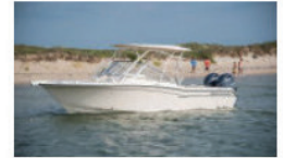
Freedom 255 (2015-)