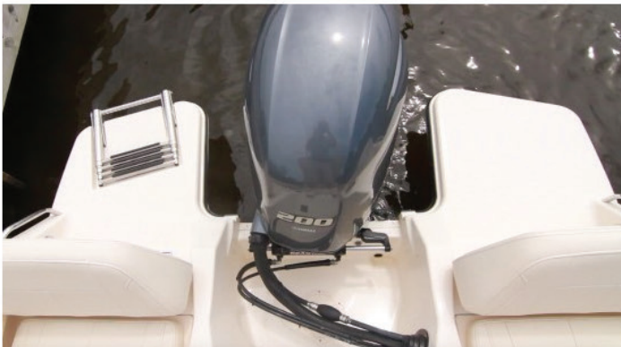
The dual swim platforms are 28" (71.1 cm) deep by 25" (63.5 cm) wide. The starboard side houses the four-step boarding ladder in a recessed cutout.