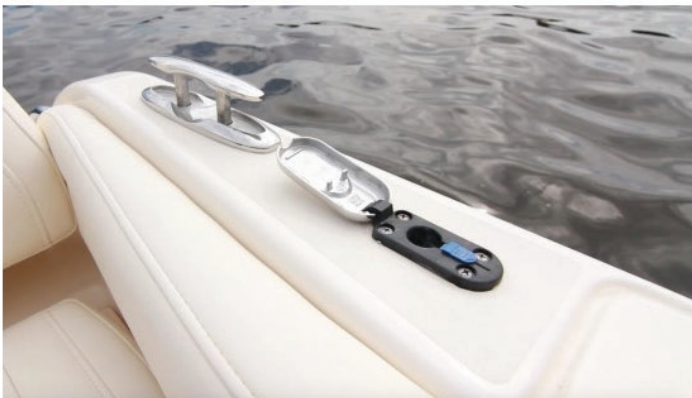
The all-round navigation light receptacle is placed on the port side aft gunnel.