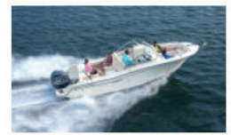
Freedom 235 (2016-)