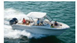
Freedom 275 (2016-)