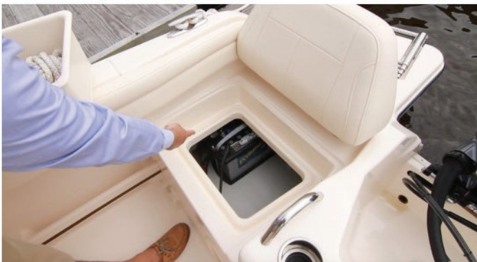
Under the starboard side removable storage box is the battery access.