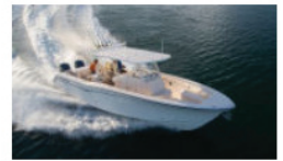
Canyon 336 (2015-)