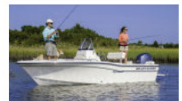
Fisherman 180 (2015-)