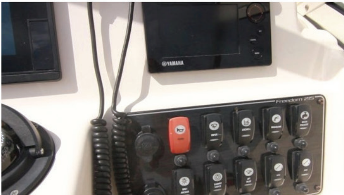
The Yamaha LCD Display is standard along with the switch panel, 12V outlet, and 5V duplex USB port. Note the horn switch is red for easy identification.