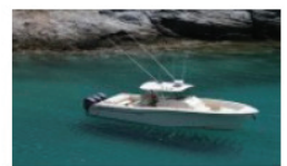
Canyon 376 (2016-)