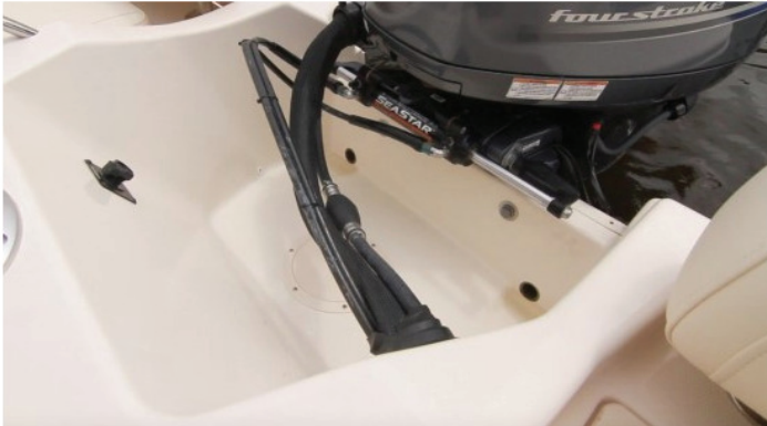
The self-draining outboard engine well keeps the outboard rigging underfoot and easily accessible.