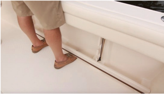
Under the gunnel is standard rod storage and a fixed toe rail for fighting fish.