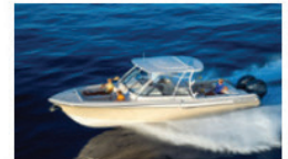
Freedom 285 (2016- )