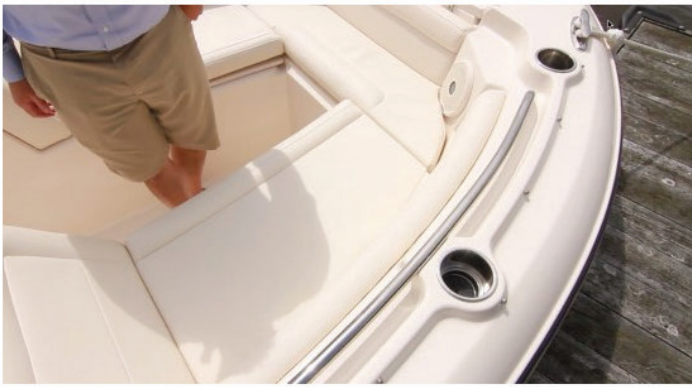
The low-profile grab rail provides safety without interfering with fishing activities. Note the standard speakers (2 in the bow), stainless-steel cup holders, and 7" pop-up cleats (2 bow cleats, 2 mid-ships, 2 in the aft cockpit port and starboard).