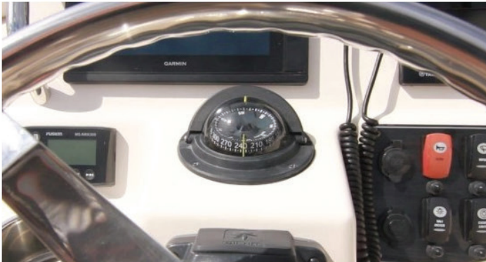
The compass is strategically situated in-line with the steering wheel.