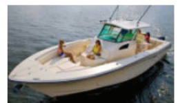
Canyon 366 (2011-)