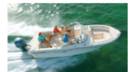
Freedom 225 (2015-)