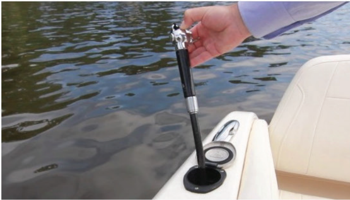
Shown here is the optional freshwater shower wand which is well positioned near the boarding platform.