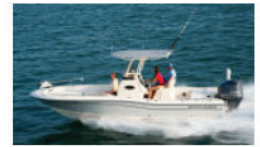
251 CE (2015-)