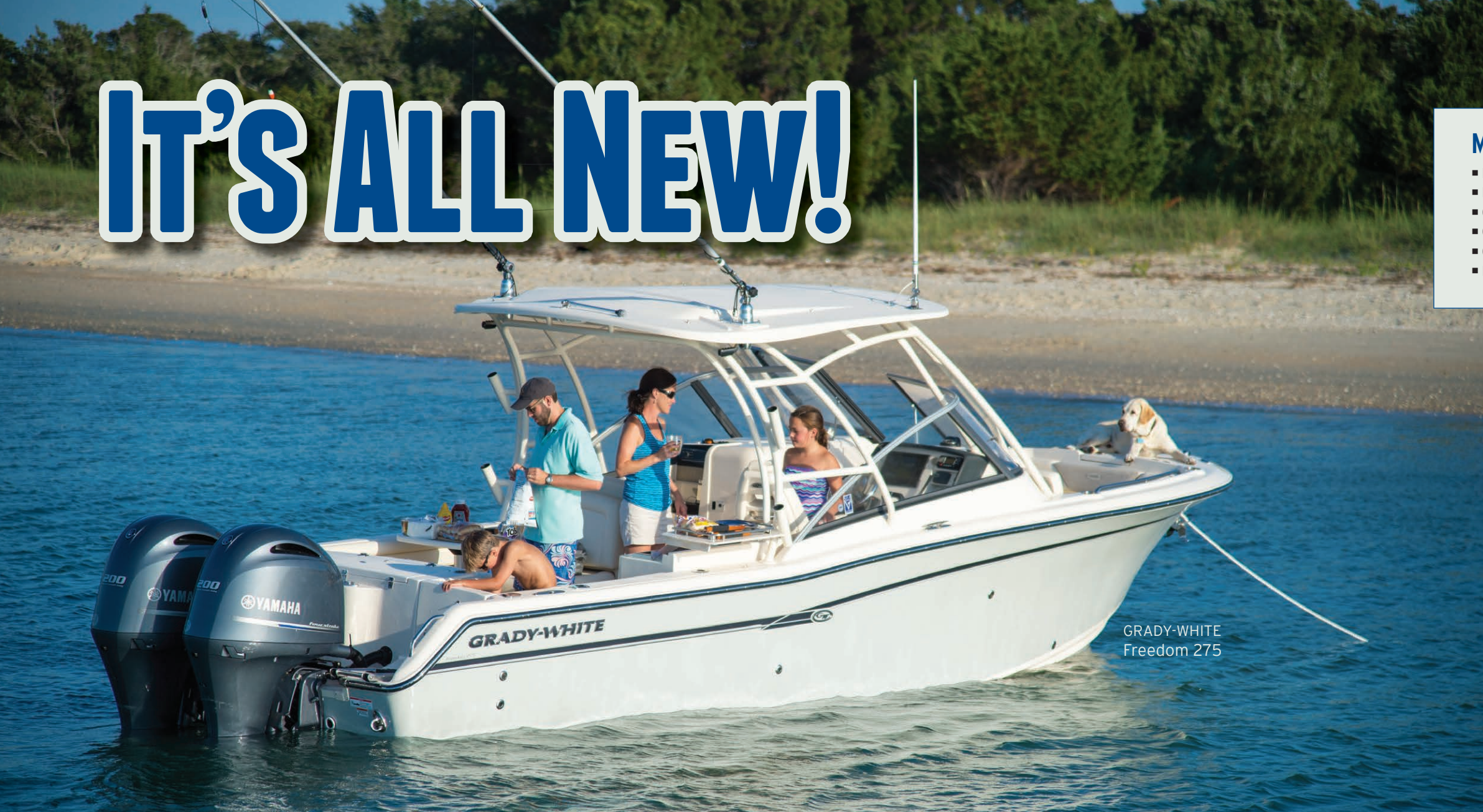
GRADY-WHITE Freedom 275