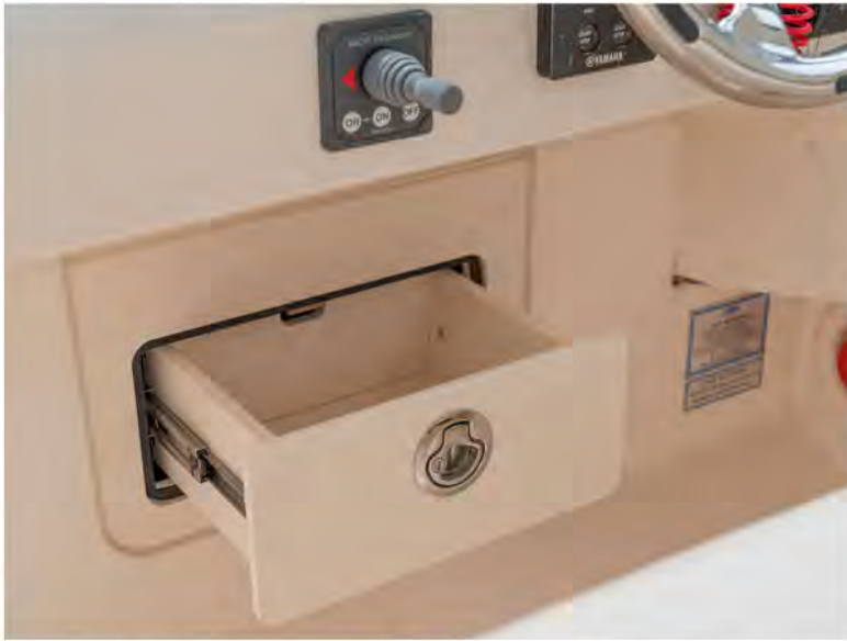
The Grady-White Freedom 285 offers plenty of storage space.

abundance of rod storage has been incorporated with holders for five rods on the deck, four rods integrated into the hardtop frame, horizontal storage for three under the gunnel and lockable storage for three more rods in the head compartment. An optional outrigger kit tops off the fishability of this superbly re-engineered boat.