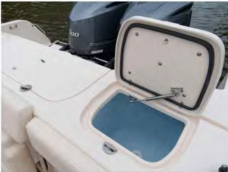
| Grady-White Freedom 285 32-gallon aft insulated livewell with light

Other options for the new 285 include a wet bar with sink and optional refrigerator, bow thruster, and a convenience package with battery charger and dockside power.