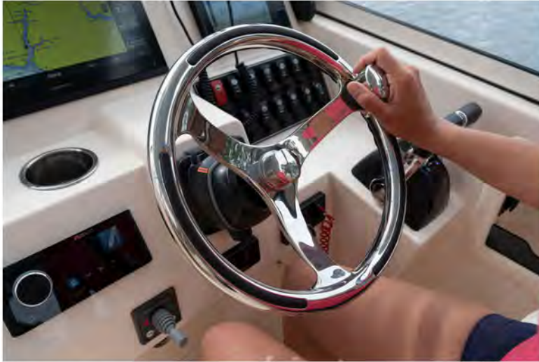
Grady White Freedom 285 improved wheel and throttle ergonomics

At first glance, you'll notice the updated sleek and sporty style. Once onboard, the upgrades start with Grady's hardtop design and an all-new expanded windshield that's taller and wider, providing more protection and comfort at the helm. With its redesigned helm station, the 285 offers larger flush mount electronics, switches that are closer to the driver, a top-mounted compass, larger footrest and improved wheel and throttle ergonomics. For added convenience, the driver's seat incorporates the luxury of electric forward and aft adjustment and is equipped with a flip-up bolster for added comfort.