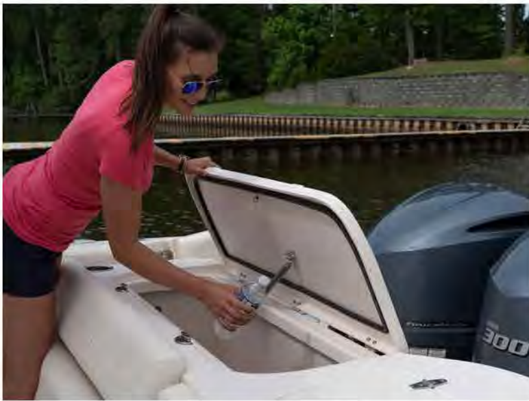
| There's space for everything on the Grady-White Freedom 285