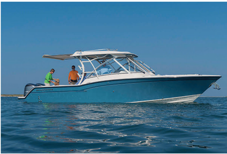
The Grady-White Freedom 325 is a 32-foot premium luxury dual console combining comfort, ease of use, and family-and-fishing amenities with saltwater performance. A wraparound windshield integrated into the standard hardtop gives the Freedom 325 a striking look.

Christian Carraway, product designer at Grady-White, states, “Even a very quick look at this boat tells you that we’ve taken a real step ahead not only in practical ease of use—access to the head is just the most obvious example—but also in style. The hardtop is standard—as it is in all of our models over 30-feet. But this one is different, and sleeker than ones you see on other brands. First, it’s larger by comparison and comes complete with an overhead rail and flush mount electronics area, plenty of rod holders, LED lighting, and a self-contained retractable SureShade® shade system. The windshield configuration and its integration with the hardtop is a striking look. The windshield is more curved, more ‘wraparound’ than others, and also offers a well-engineered ventilation feature that allows greater air circulation even in rain and wind, yet buttons up tight when need be.”