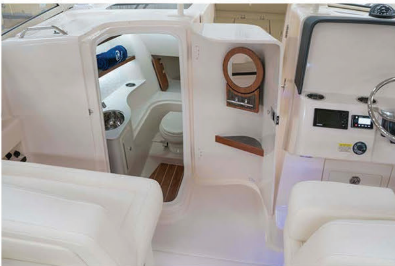
Grady-White engineers provided easy access to a fully appointed head in a 32’ dual console.

Christian Carraway, product designer at Grady-White, states, “Even a very quick look at this boat tells you that we’ve taken a real step ahead not only in practical ease of use—access to the head is just the most obvious example—but also in style. The hardtop is standard—as it is in all of our models over 30-feet. But this one is different, and sleeker than ones you see on other brands. First, it’s larger by comparison and comes complete with an overhead rail and flush mount electronics area, plenty of rod holders, LED lighting, and a self-contained retractable SureShade® shade system. The windshield configuration and its integration with the hardtop is a striking look. The windshield is more curved, more ‘wraparound’ than others, and also offers a well-engineered ventilation feature that allows greater air circulation even in rain and wind, yet buttons up tight when need be.”