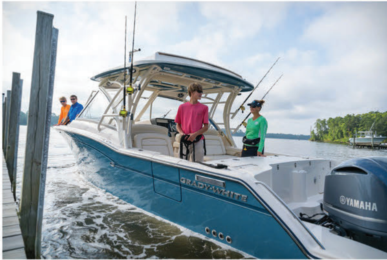
The Freedom 325 is a fisherman's dream

For every captain, the ergonomically designed helm with well-placed controls and switches, and room for large screen electronics, plus the fully adjustable deluxe helm chair, make for a great day on the water whether running offshore or cruising the waterways. Combine ride and handling superiority with the extraordinary safety and performance of a SeaV 2 hull, powered by either 300 HP or 350 HP twin Yamaha four-stroke engines, and the Freedom 325 will be your next boat that comes standard with the ultimate boating experience. Today's technology-loving captains can add Yamaha's Helm Master ® with Set Point ™ control system , for even more performance and handling capabilities.