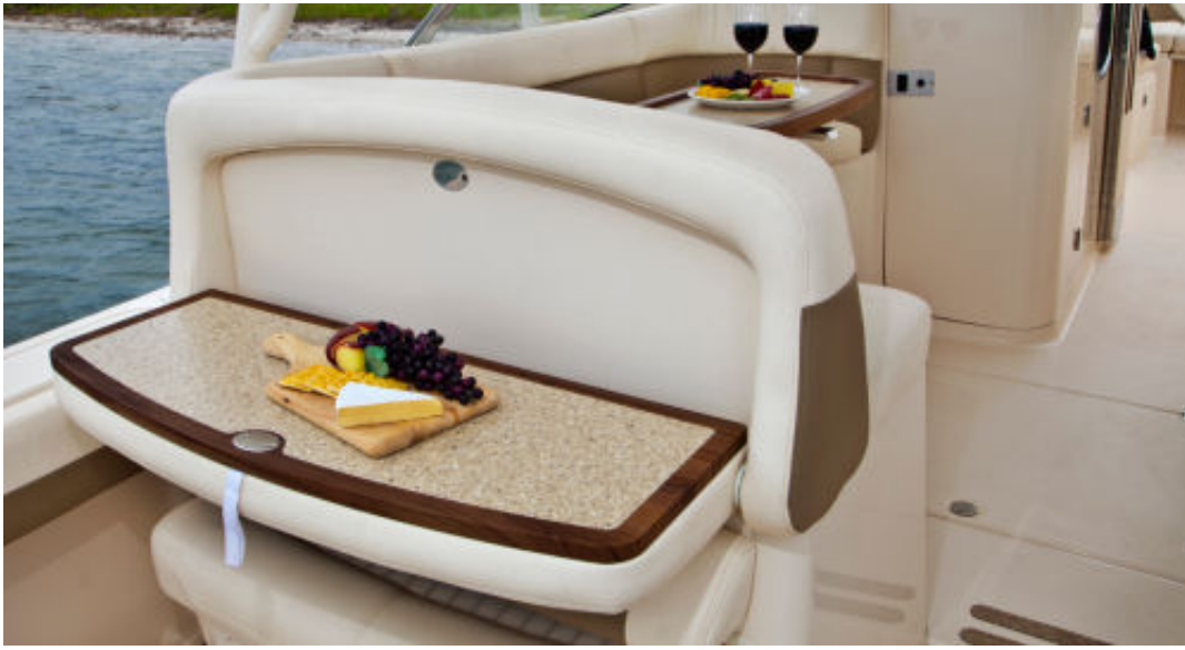
This fold down counter with Corian inlay makes a classy sideboard upon which to set up hors d'oeuvres and stemware.