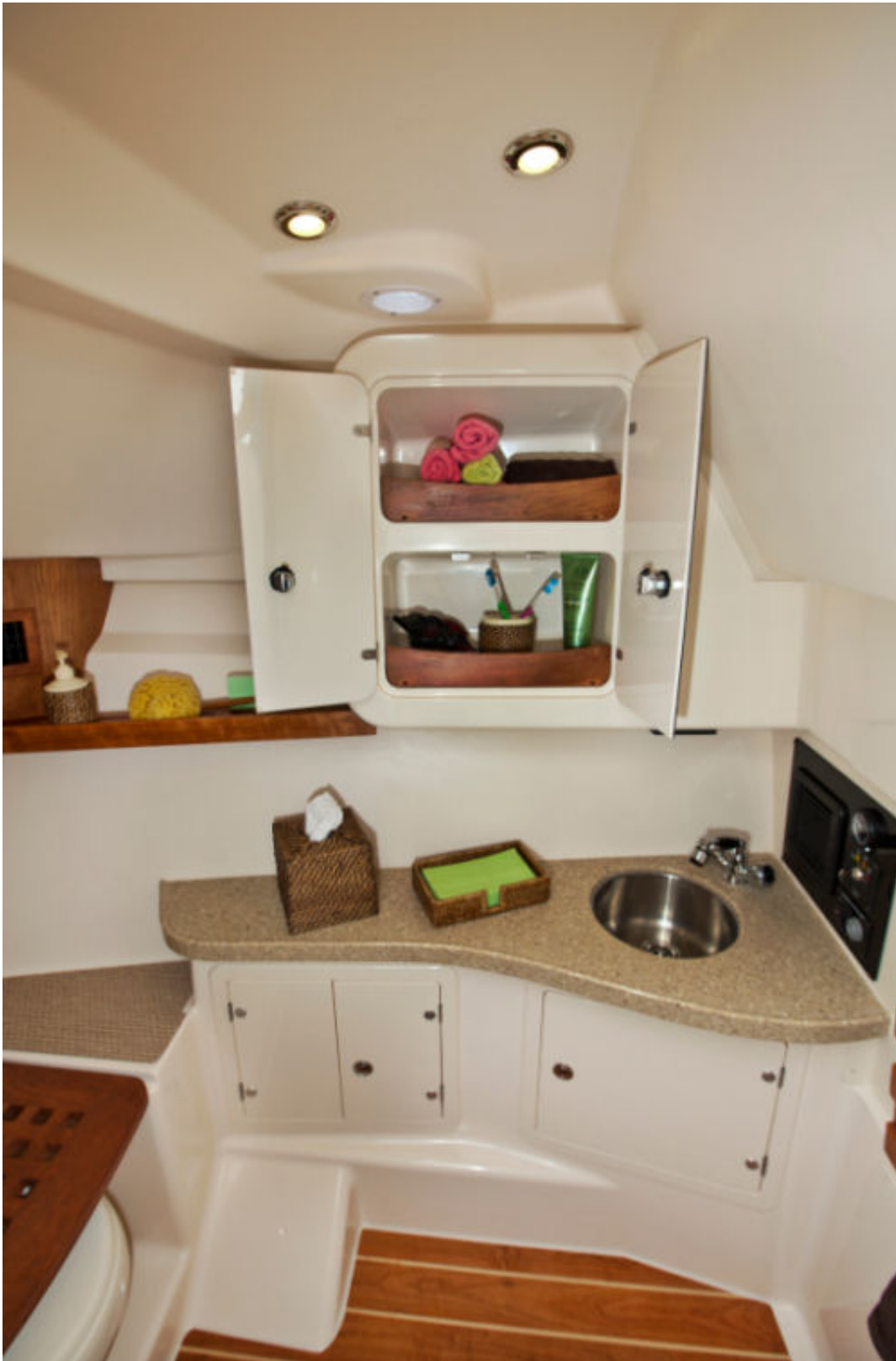
This is a large head as dual consoles go. Note that there is adequate storage and place to keep the toilet paper dry.