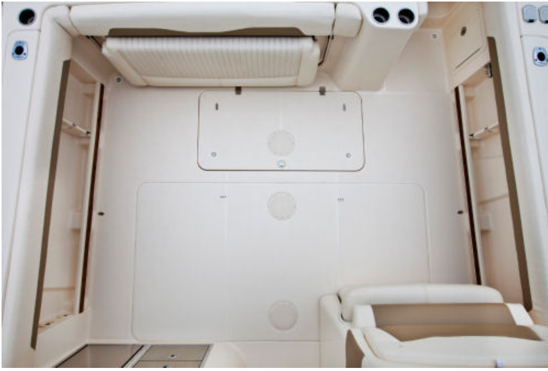
Bird's eye view of the aft cockpit with the fold away transom seat out of the way and the electrically actuated seat to port retracted.