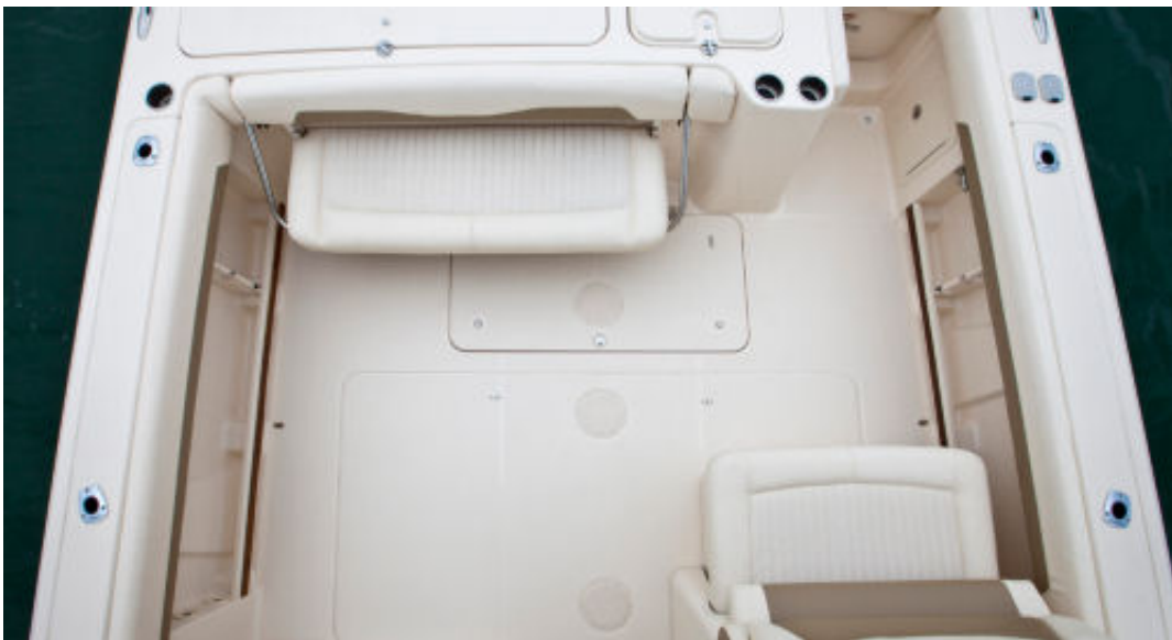
Here both seats are ready for guests. Grady-White also has an optional fold-out seat that will go in the bulwarks at the left. For those planning on a lot of entertaining, we would recommend that option.