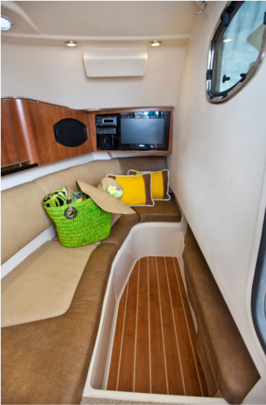
Looking forward in the portside cabin. Note the lip of the platform at right that will make up a bed when electrically activated.