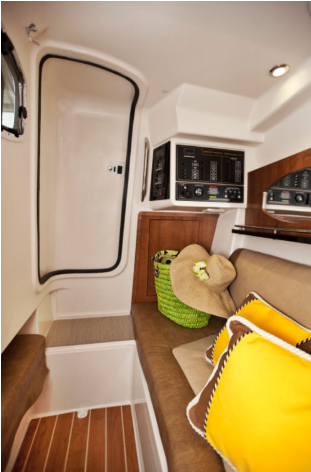
Looking aft to the closed console door in the boat's port side cabin. There is storage behind the beach bag. Note standard cherry and holly cabin sole.