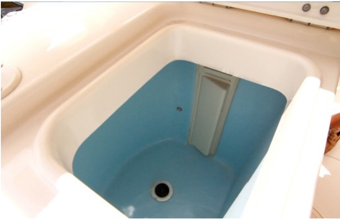
A close look at the 25-gallon (95 L) livewell which has full column aeration. It drains overboard.