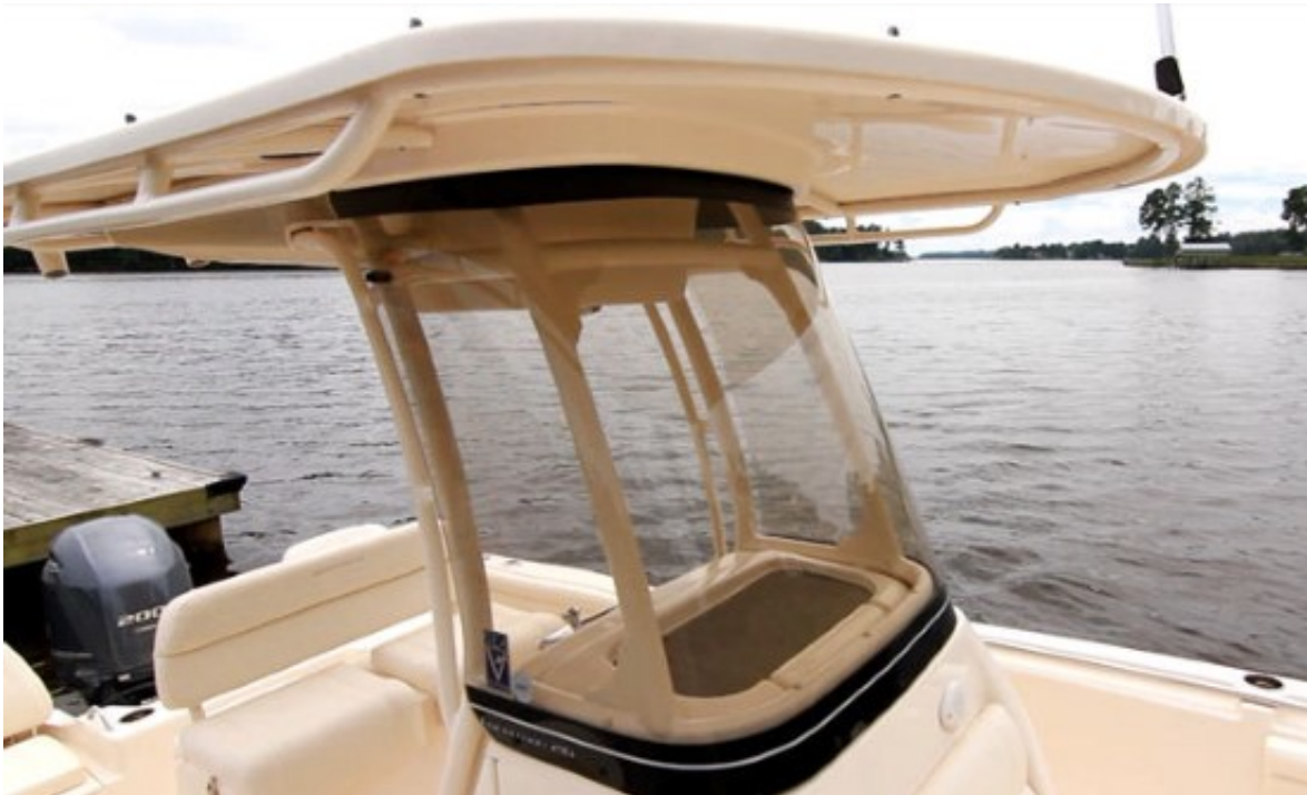
The helm of our test boat was equipped with the optional T-top with scratch-resistant acrylic wraparound windshield.

As one would expect, the Fisherman 216’s helm has been well-designed. The steering wheel is to port, not in the center as we sometimes see. The compass on the dash forward is aligned with the hub of the wheel, and not centered on the console, as many builders do. The ignition has been placed under the wheel so the kill-switch lanyard is easy at hand, but the ignition key is out of the knee-strike zone. These are all small details, but important ones.