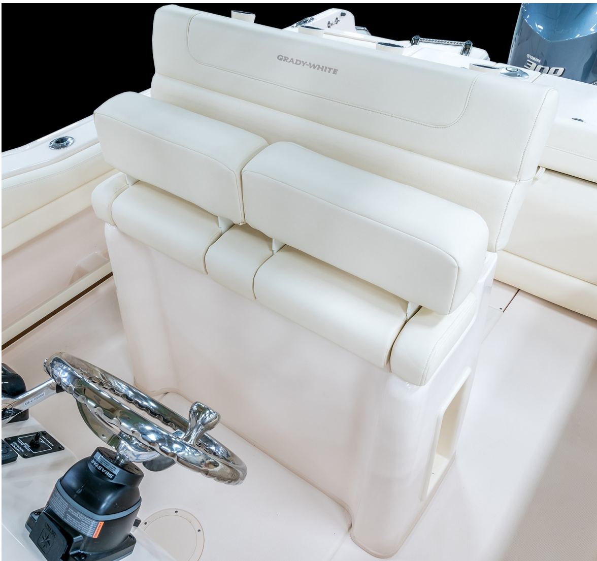
With the twin bolsters up, the seats turn into a leaning post.