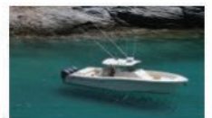
Canyon 376 (2016-)