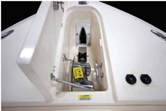
A view of the windlass hatch. Note the cleat on the starboard side of the compartment. This is important because the windlass should not be used as a cleat as some builders do.