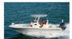
251 CE (2015-)