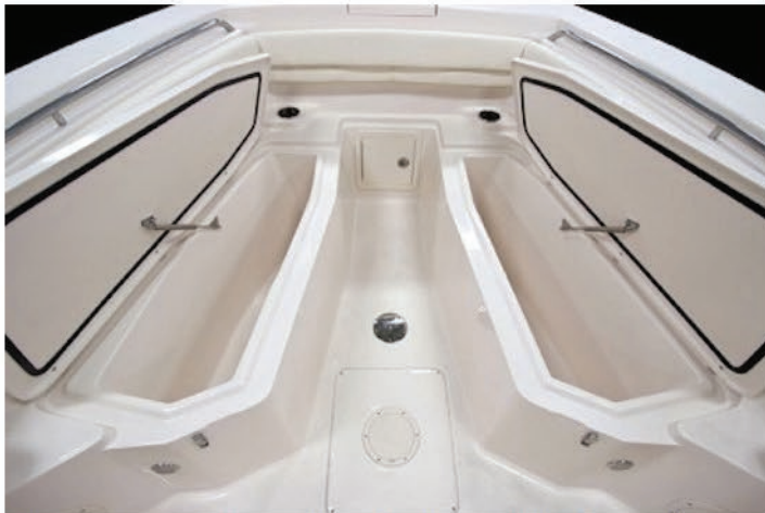
The same bow seating section with the seats lifted to reveal the twin 150 qt. (142 L) fishboxes underneath.