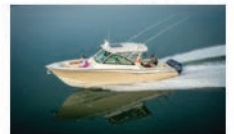
Freedom 375 (2015-)