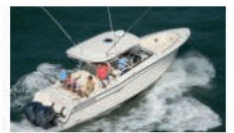
Freedom 307 (2015-)