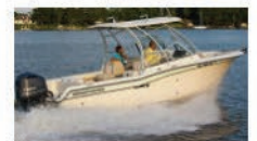
Freedom 255 (2015-)