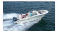
Freedom 235 (2016-)