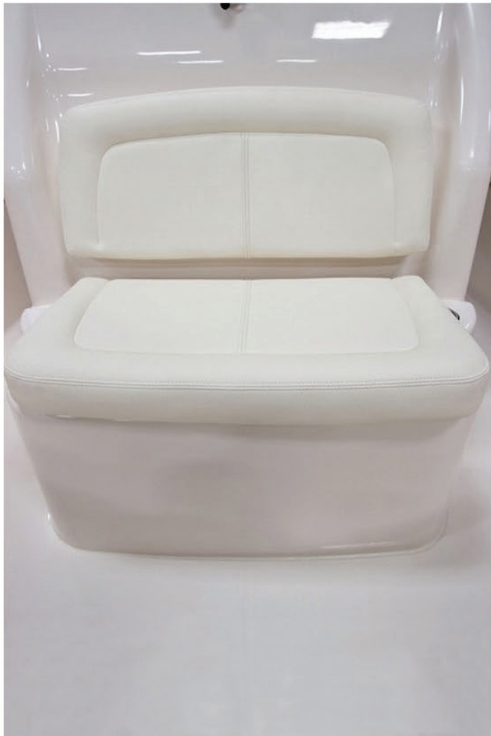
The forward-facing jump seat on the front of the center console.