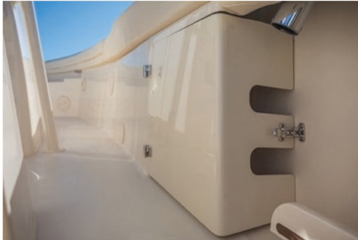
A view of the horizontal rod storage locker, molded into the gunwale.

• Ample Rod Storage. The Canyon 306 has rod storage in the gunwales, further rod storage under the gunwales, and horizontal rod storage locker that can accommodate as many as six fishing rods.