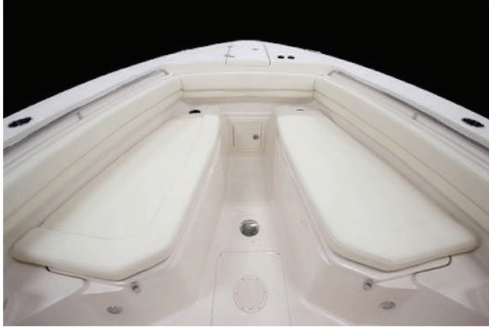
The bow seating section. Note the bolsters, the flush deck, and the windlass hatch.

Seating alongside fishing practicality. The front-facing side of the center console has a molded seat with cushions. The entire bow has bolsters around the tops of the gunwales with the deck of the bow being flush with flush-mount cleats and flush lighting to eliminate obstruction while fishing.