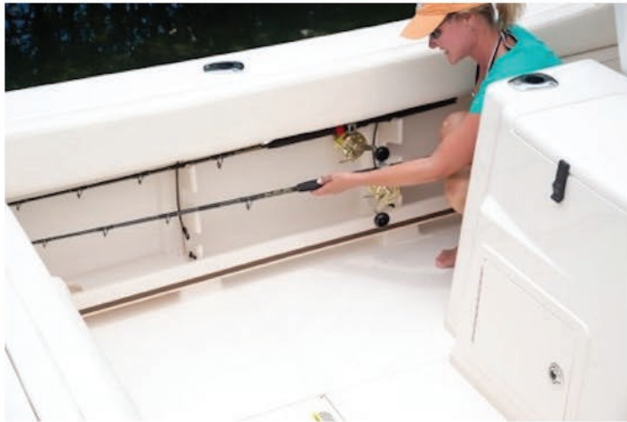
Rod storage that keeps them secure and easily accessible.

Along the transom is fold-down bench seating, the backrest for which sits up against the 304 qt. (287.7 L) fishbox, a generously sized space for the day's catch that can fit much larger fish if needed.