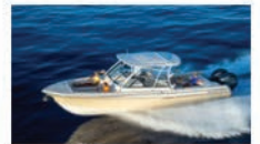
Freedom 285 (2016-)