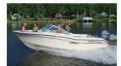
Freedom 192 (2015-)