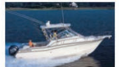
Express 305 Canyon 306 (2017-)