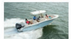
Fisherman 236 (2016-)