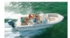
Freedom 225 (2015-)