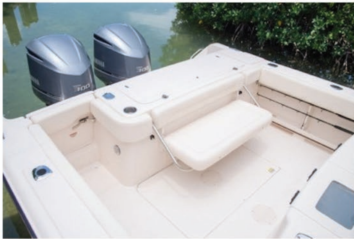
The fold-down transom seating, just forward the fishbox. Note the cup holder, as well as the rod holders visible in the gunwales.

Along the transom is fold-down bench seating, the backrest for which sits up against the 304 qt. (287.7 L) fishbox, a generously sized space for the day's catch that can fit much larger fish if needed.