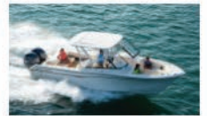
Freedom 275 (2016-)