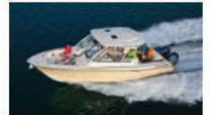
Freedom 335 (2015-)

• SeaV2 Hull Design. The SeaV2 is a "continuously variable vee" hull that provides a softer, more stable ride. It was designed by Ray Hunt & Associates.