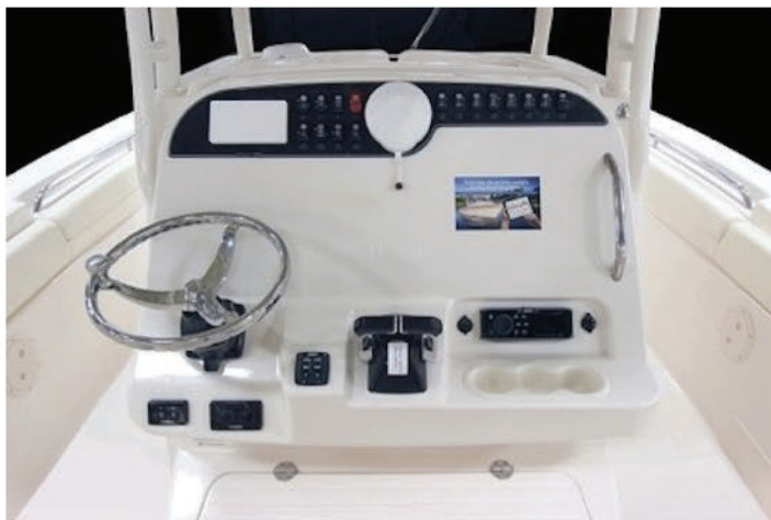
A view of the dash. Note the stainless steel steering wheel with knob.

Command elite helm chairs. The forward-facing end of the lean bar holds the helm chairs. These are Command Elite helm seats and are horizontally adjustable with arm-rests, and flip-up bolsters on both seats. A hatch in between the seats lifts up to reveal storage space.