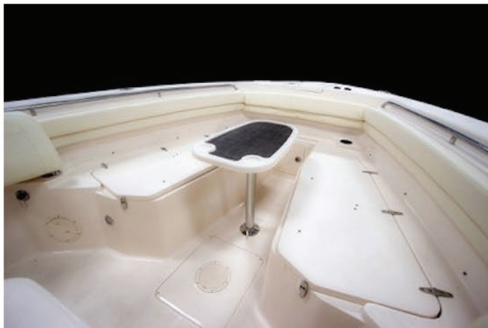
The optional fiberglass table for the bow section of the boat. Note the lack of cushions on the seating here -- they come as an option only.

The Canyon 306 is not an options-heavy boat. The lion's share of those offered are grace notes to what is largely a fishing-oriented basic package. Here are some of the more significant options offered: