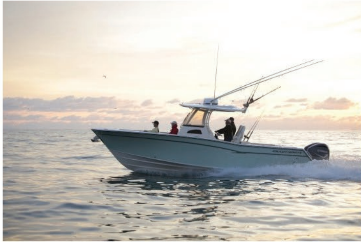
The Canyon 306 comes with a choice of three Yamaha twin four-stroke engines.

The Canyon 306 can truly take advantage of that brawny build and SeaV2 hull design with three Yamaha twin outboard four-stroke engines: