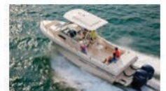
Gulfstream 232 (2015-)