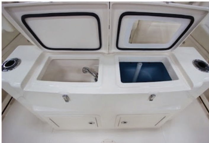
The aft side of the deluxe lean bar with 47-gallon livewell to starboard and the retractable faucet to port. Note the cup holders, as well as the tackle storage latches below.

The gunwales have dedicated rod storage, great for keeping them secure but easy-access later. The gunwales also have toe rails and bolsters to mitigate any leaning and pulling a vigorous struggle overboard may bring. Further, there is a horizontal rod storage locker in the gunwale that can fit as many as six fishing rods. Both port and starboard have three stainless steel rod holders each in the top of the gunwales.