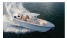
Canyon 336 (2015-)