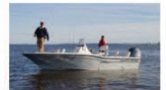
191 CE (2015-)