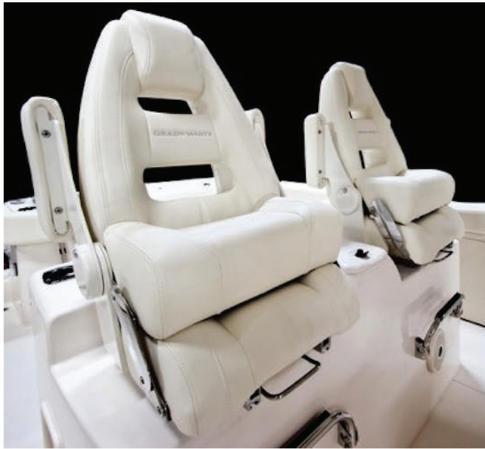
The Command Elite helm chairs, which can adjust horizontally. Flip-up bolsters are up; note the storage latch in between chairs.

Command elite helm chairs. The forward-facing end of the lean bar holds the helm chairs. These are Command Elite helm seats and are horizontally adjustable with arm-rests, and flip-up bolsters on both seats. A hatch in between the seats lifts up to reveal storage space.