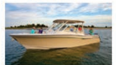
Freedom 335 (2013-)