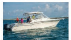
Express 330 (2015-)