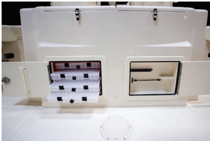
The tackle storage on left and the bulk storage on right at the bottom part of the deluxe lean bar in the cockpit.

• Freshwater Sink. Saltwater fishing can be a messy affair between the bait and the catch -- the lean bar just aft of the helm seats feature the aforementioned livewell as well as a fresh-water sink, sitting under a latched surface as a pull-out faucet.