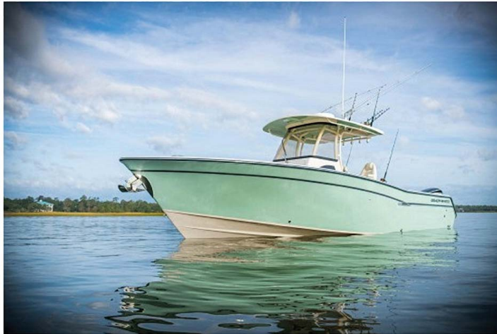
A roomy, rugged, comfortable boat built for fishing.

Simply put, the main attractions for the Canyon 306 is the quality of the ride, the over-all look, the practical design, and the rugged construction that Grady-White is known for. So, while this is primarily a saltwater offshore fishing boat, there may be a tendency to want to open its use up to other types of excursions.