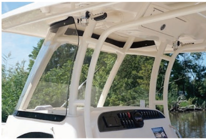
A view of the T-top hardtop. Note the lockable storage latch. Netted storage just out of frame. Note the good visibility forward and that the supports are grounded in the console itself.

T-top hardtop. Integrated with the center console is the Canyon 306's hardtop, a fiberglass cover that has a number of features. First is storage -- the netted above-head storage is a great way to get simple, light items out of the way and secure when in motion.