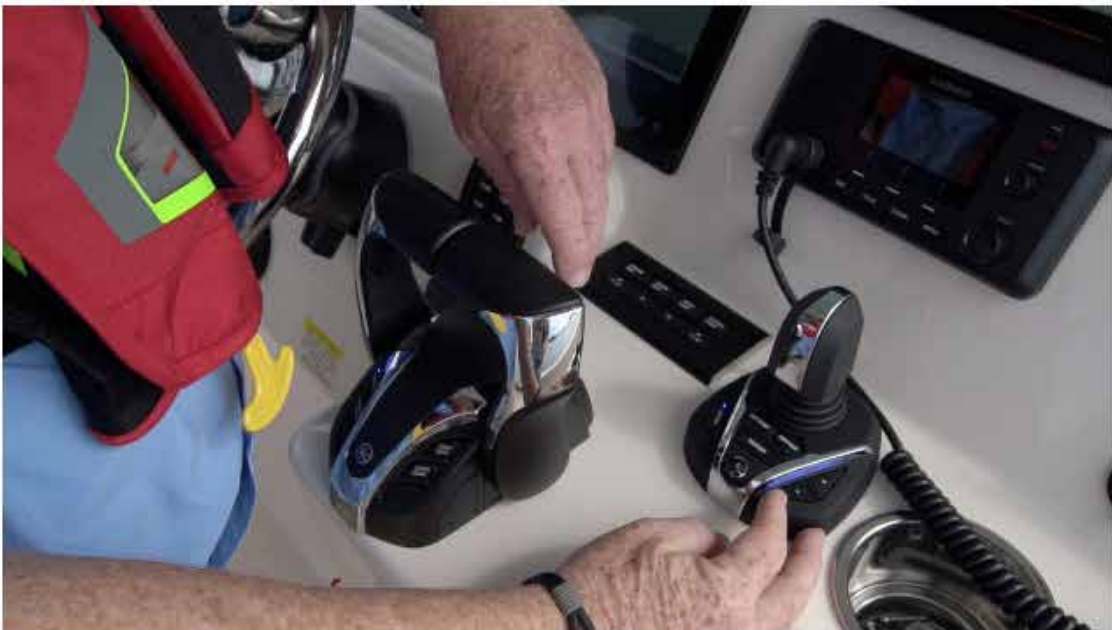
The Helm Master joystick has many new features, including three station keeping modes and five power adjustments