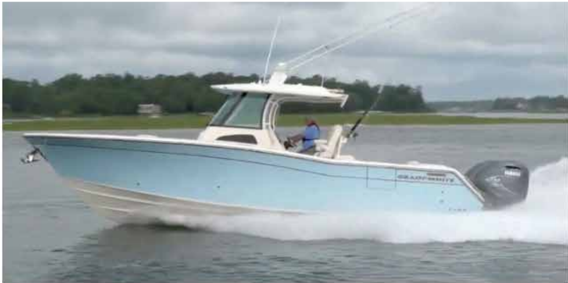
The Grady-White Canyon 336 is improved from stem to stern, keel to hardtop.

Yes, you can have it all. And it's all in one package with the Canyon 336. This model has been around for quite some time, but Grady-White has recently upgraded the boat to include a boatload of features thanks to listening to the voice of the customer. The result is a 336 that's better than ever.