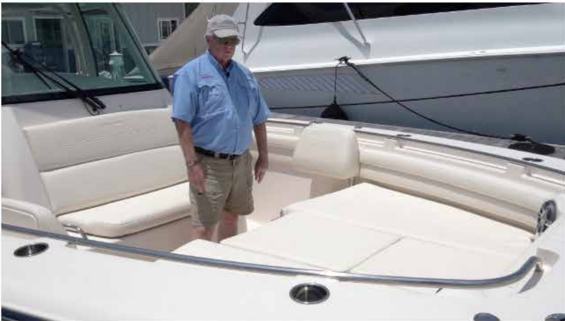
With the filler cushion in place, the sunpad measures 7'4" (2.23 m) across at the aft end, 5' (1.52 m) at the forward end and 4'7" (1.40 m) fore and aft.