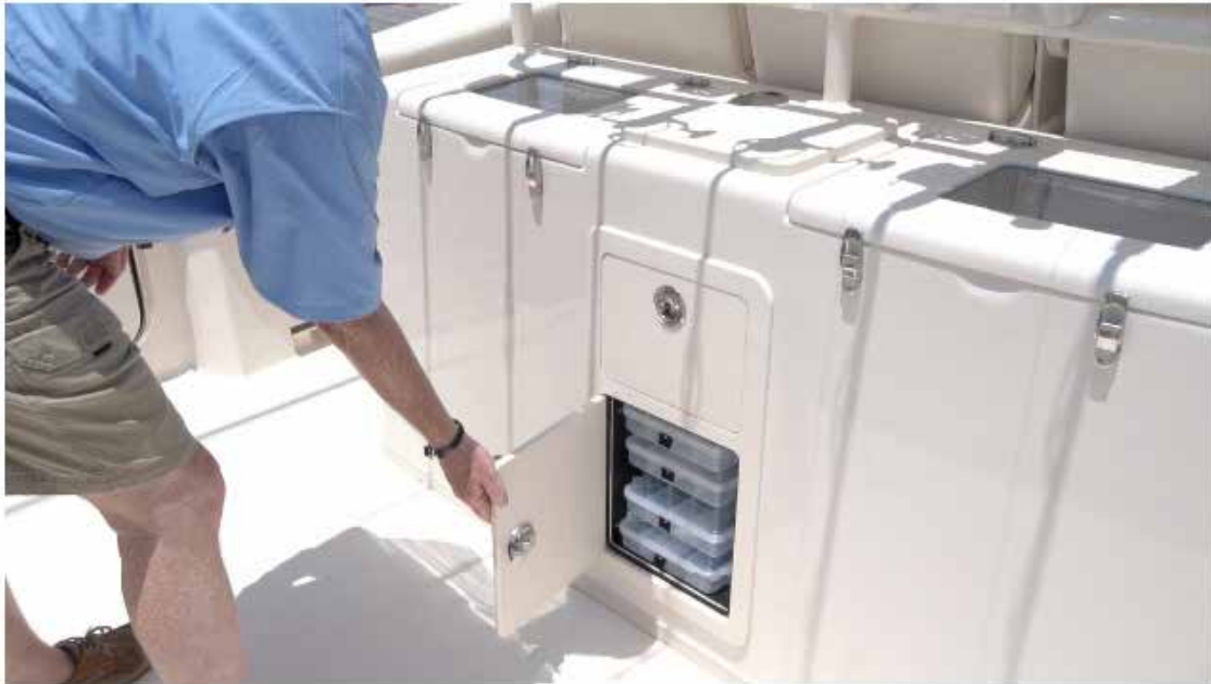
The rigging station includes one, or two, livewells. A freshwater washdown is between with a cutting board. Below is storage.

Rod storage is the least of the concerns on the 336. There are six rod holders at the rigging station, four more across the trailing edge of the T-Top, 11 more in the caprails surrounding the boat and we could increase that by six if Grady would swap out the caprail-mounted beverage holders for combination rod/beverage holders.