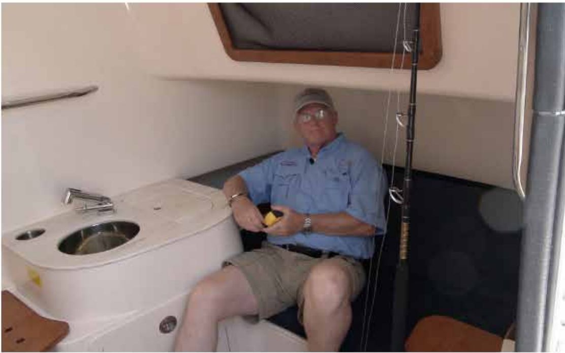
inside the cabin, there's a berth that now includes a flip seatback to convert to a sitting area. Notice the rod that is in one of the 6 vertical rod holders.