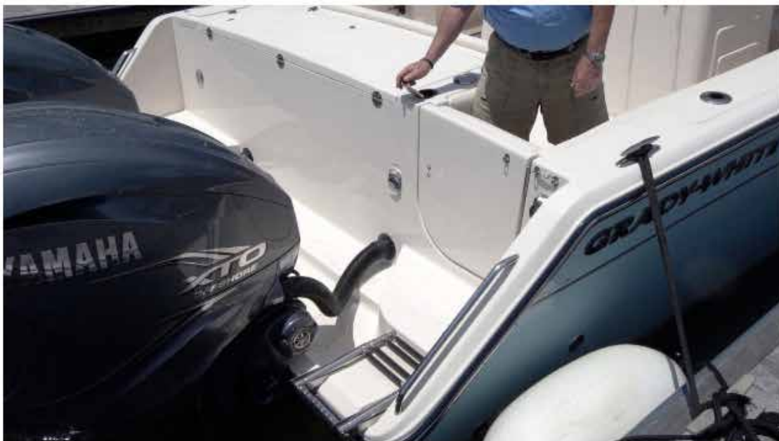
A transom gate leads to the swim platform and the four-step reboarding ladder. A freshwater shower is right alongside.

At the bow, the V-lounge seats have standard swing-away backrests that provide either additional comfort or more room for moving about. Storage is underneath. A table can be added to increase the functionality, and this can be lowered to form a sunpad with the addition of a filler cushion. Receivers are built into the caprails to accommodate carbon fiber stanchions that will support a bow sunshade. A double-wide seat is ahead of the console.