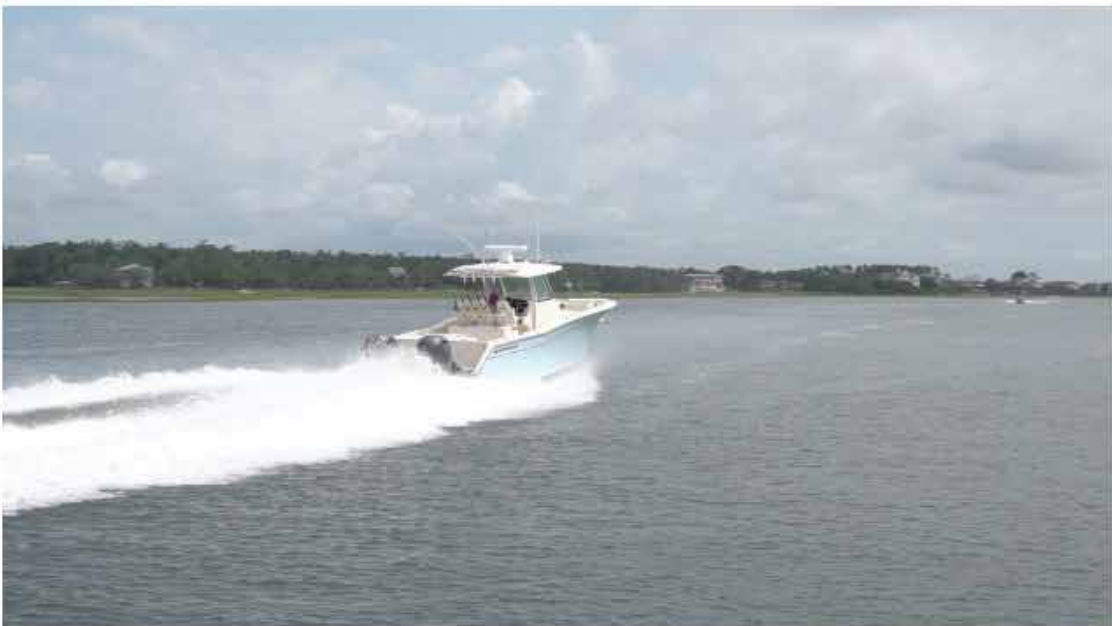
With the engines properly trimmed for running, there won't be much change in the running attitude.

Once she's up on plane, bring the outboard trim up to about the halfway mark on the scale to put her into her optimum running attitude. There won't be much change in her running angle, but the props will be more efficient.