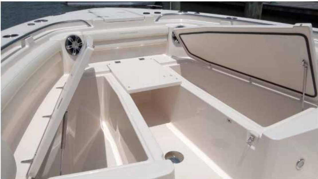
The bow includes 204-qt (193.06 L) fishboxes under the side seats.