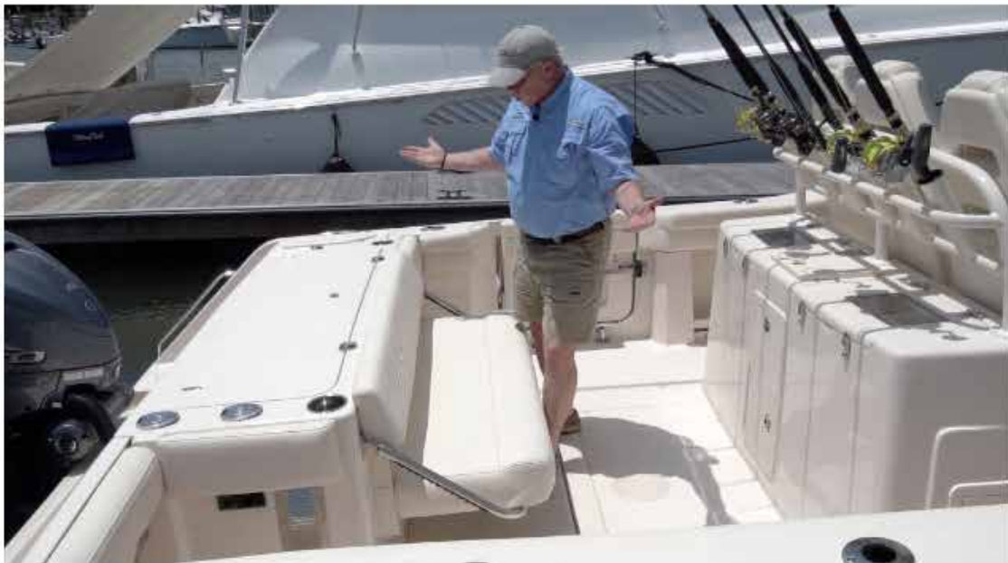
The transom bench seat is easy to deploy and stow away.

Family features have to start with the patented fold-away transom bench seat. Grady-White was smart to get a patent on this design. It's flat-out the easiest we've seen to deploy and stow. At the entrance to the swim platform, there's a freshwater shower with a hot/cold mixer to clean off after reboarding.