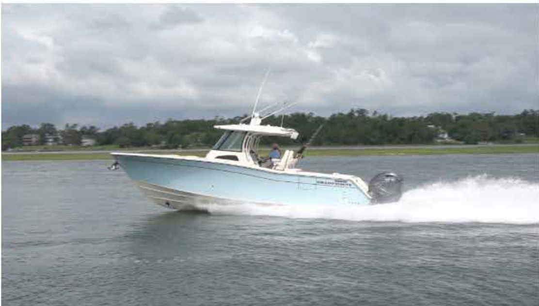
Twin 425-hp Yamaha XT0s brought to a top speed of 50.6 MPH.