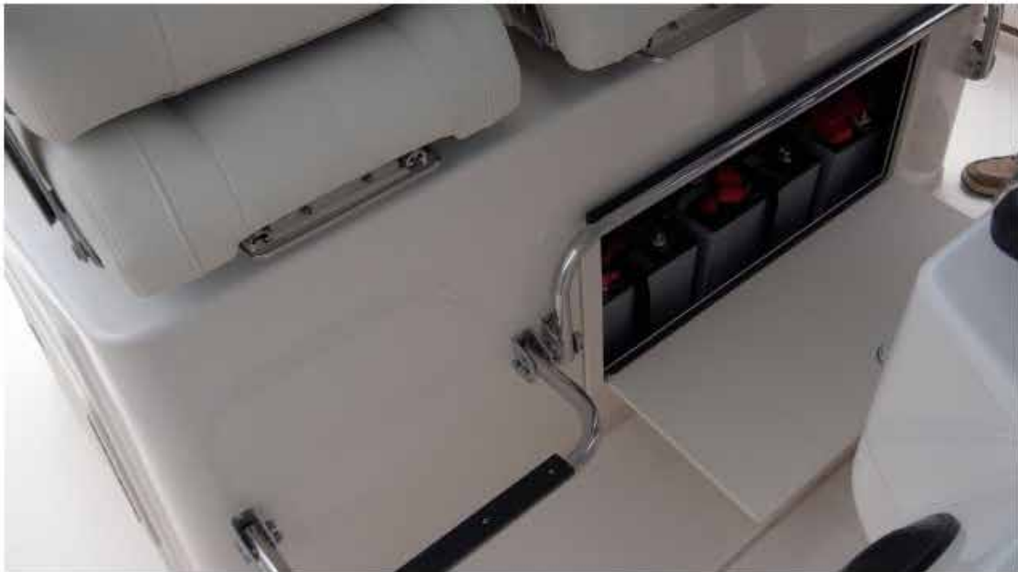
The batteries are all easily accessible under the helm seats. A larger flip-down footrest accommodates the hatch just behind.

Below the main 17" (43.18 cm) displays and to the left of the console is a cubby with a padded surface and connectivity. An Apollo series Fusion stereo is below that. The helm seats are three across, which allows Grady-White to incorporate a center-mounted helm station for better all-around visibility. And it's always nice having extra eyes watching out when underway. All seats are well-padded and ventilated, slide fore and aft, and all include flip armrests and flip bolsters. Below are two flip-down footrests in a 1/3-2/3 configuration. The wider is because there's a hatch behind that opens to reveal the vessel's battery banks.