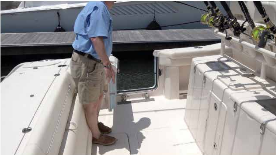
The hull side dive door is now standard on the 336 and loaded with impressive features.

Previously an option, the inward opening side door is now standard. The latching system is exceedingly easy to use, and the door swings on heavy duty hinges. Because it opens inward and is low to the waterline, there is the added advantage of using it as a boarding location from a floating dock or a tender.