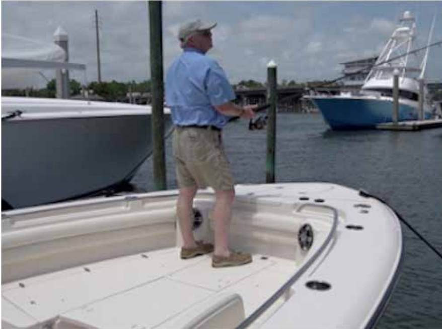
The bow features seating that converts to a large casting platform.