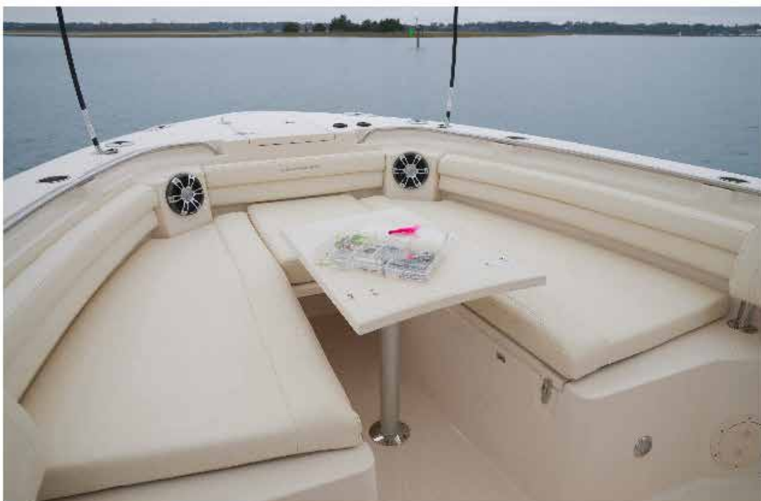
Grady-White has made a comfortable and functional bow seating area. Notice the high padded bulwarks.

At the bow, the V-lounge seats have standard swing-away backrests that provide either additional comfort or more room for moving about. Storage is underneath. A table can be added to increase the functionality, and this can be lowered to form a sunpad with the addition of a filler cushion. Receivers are built into the caprails to accommodate carbon fiber stanchions that will support a bow sunshade. A double-wide seat is ahead of the console.