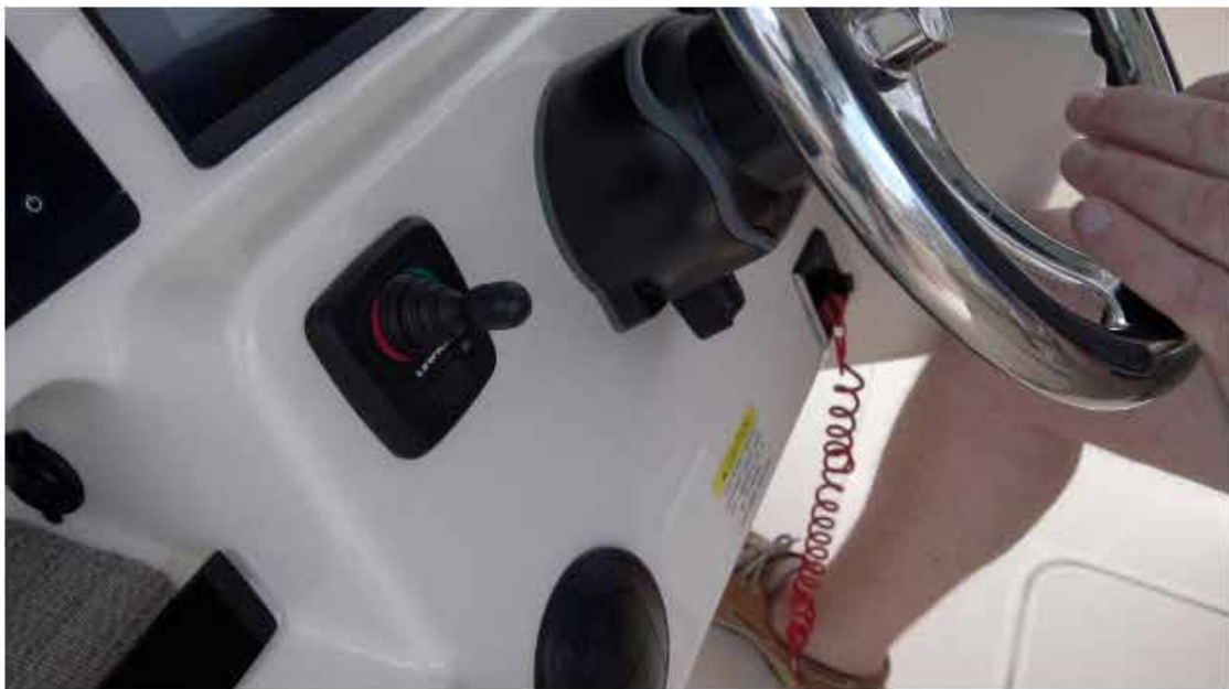
An optional bow thruster is controlled by a joystick to the left of the tilt wheel. The stainless wheel also has rubber grips on the top and underside, and we always appreciate the addition of a steering knob.