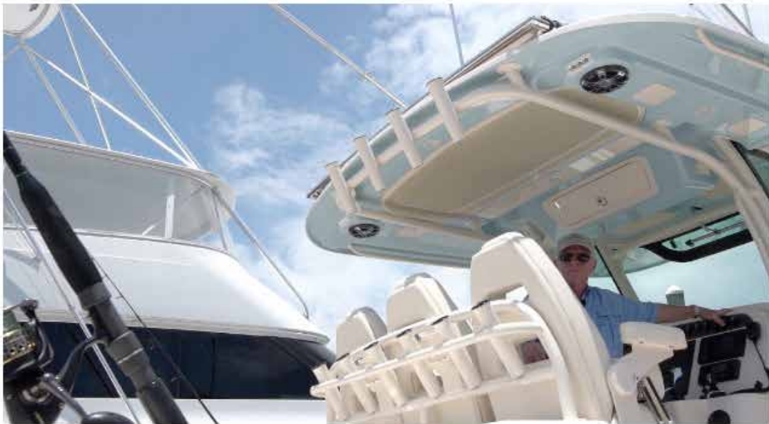
Rod holders are everywhere on the 336, starting at the tackle station.