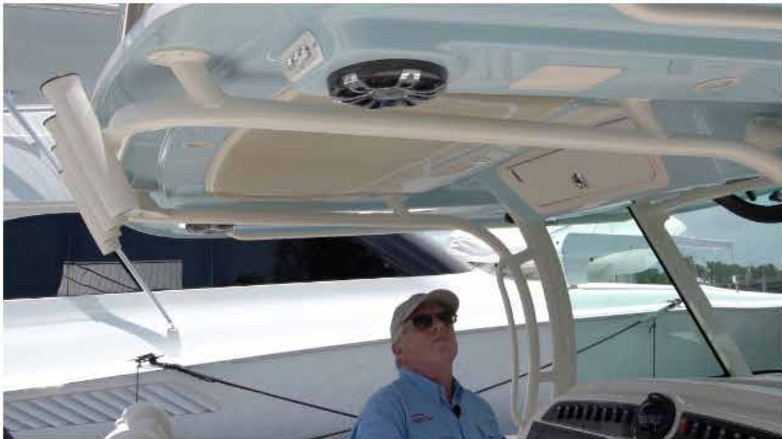
The T-Top is fully featured and includes PFD storage. Most important is how it integrates into the windshield.

The top was also redesigned to accommodate the optional SureShade® electrically retractable awning w/Sunbrella® canvas that extends well out to the aft section of the cockpit at the trailing edge. The new arrangement makes the awning much less bulky, and now the mechanisms are well hidden and protected.