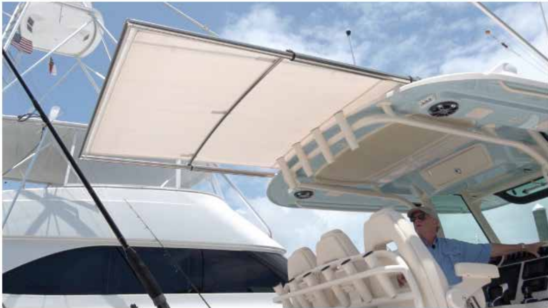
A SureShade® electrically retractable awning is now integrated and concealed into the top of the hardtop.