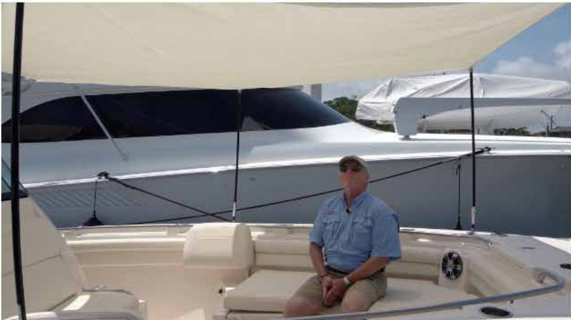
A shade can be added to the bow for additional comfort. Notice the swing-away seatback.