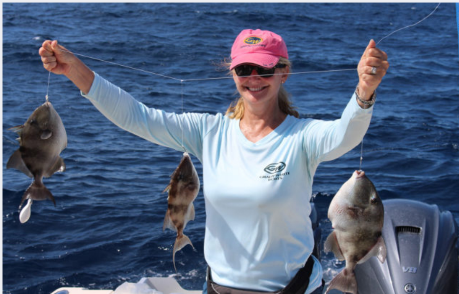
When we got on top of the triggerfish – and stayed there – triple-headers started coming over the gunwale.

YOU THINK A FEATURE LIKE THAT MIGHT HELP YOU FISH A WRECK OR REEF MORE EFFECTIVELY? DAMN STRAIGHT.