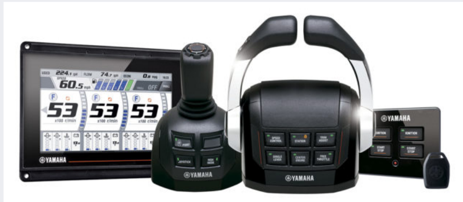
The new Helm Master incorporates the controls and a joystick, sure. But Set Point is the feature of interest to anglers.

Naturally, this rig was fitted out with every perk and pleasure (air-conditioning in the cockpit, anyone?) including Yamaha Helm Master. But now the system includes what Yamaha calls "Set Point." Set Point integrates GPS and heading sensors to initiate any one of three modes: Stay Point, Fish Point, and Drift Point.