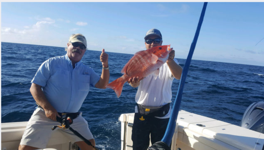
When we had picked through the grouper, the snapper started biting... or so it seemed.

We caught a few more gags and then the bite slowed, so my fish-brain said it was time to shift positioning over the wreck a bit. Usually, I would slack back 15 or 20-feet on the anchor line to remain on the wreckage but get the baits into a slightly different area, where we might find some new fish. I was about to suggest as much. But before I did so the bite came on again. This time, however, it was snapper.