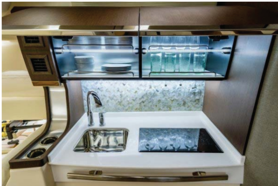
Grady-White Canyon 456 kitchen

On deck, forward of the cabin, the Canyon 456 proves it has a double life as an elegant lounge-and-leisure platform. Atoport the forward cabin, very comfortable lounge cushions create an incomparable space for sun worshippers. The bow seating area continues the theme of exceptional detail, comfort, and elegant style. There are two large plumbed, insulated boxes portside (43 and 123 quarts), and a huge 210-quart box starboard. Atoport the boxes, deeply cushioned seating complemented by three-way positioned stowable backrests surrounds two