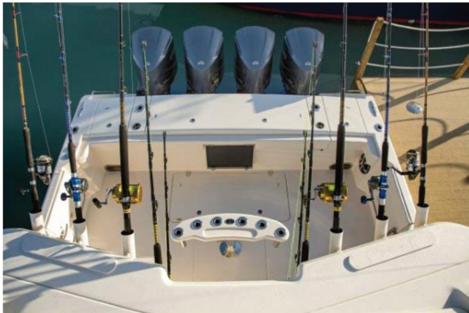
Canyon 456 Aft mezzanine/fishing center

The 456 is equipped with a Seakeeper® gyro stabilizer to give an added element of control in the most extreme sea conditions. The Yamaha Helm Master® system with Set Point™ is also standard, further providing enhanced performance. The revolutionary Zipwake® dynamic auto-leveling trim control system also assures maximum capability. This Canyon packs a variable speed bow thruster standard as well. The entire helm area is covered by a stylish, sophisticated, enclosed AV2 T-top™ with an integrated wraparound windshield for maximum visibility and protection. Electronic side windows and a large overhead hatch allow plenty of fresh air when the heating or air conditioning system is not needed. This top includes a built-in SureShade® electronically retractable cockpit shade and LED spreader lights forward and aft. Top-of-the-line deluxe GEMLUX® carbon fiber outriggers are available. The underneath of the top features digital lighting and a huge netted storage area—a Grady specialty. Ten rod holders here are fishing-ready, and four deluxe stereo speakers provide the soundtrack to any adventure. For extra convenience, this Canyon comes equipped with a remote-controlled anchor light on the T-top, making the transition from day to night as simple as a press of a button. Safety handrails are seamlessly built-in, just where you need them.