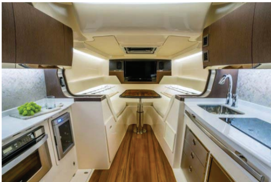
Grady White Canyon 456 Cabin

Ease of use and technical achievement aboard the Canyon 456 start with Grady's exclusive Sea Command Center™—aesthetically striking, exceptionally comfortable, and offering an amazing assembly of technology. The center's ultra-comfortable forward-facing seating features four premium individual electronically adjustable seats, each replete with rich upholstery and stainless supports for the armrests. A fold down footrest for each adds even more comfort. The starboard center seat accommodates the captain, who has an easy reach to the ergonomically arranged array of systems, electronics, and controls at the helm. CZone® digital switching technology enables one-touch control of on-board systems including power, electrical, lighting, heat and air conditioning—even the seacocks. A software application allows remote command of these functions from your phone! Grady's sea chest raw water reservoir allows remote electronic control for livewells, generator, air conditioning, washdowns, and more. The helm also holds the Fusion Signature Series stereo system controls for the bow and T-top speakers. A separate Fusion Signature unit is located in the console cabin.