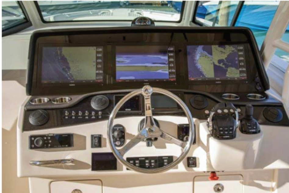
Grady-White Canyon 456 center console

Few if any luxury sportfish builders can boast of a better “business end” of the cockpit than the engineers at Grady-White. The extra beam on this Canyon allows the integration of the Sea Command Center’s amazing aft-facing fishing station, with dedicated air conditioning/heating vents and seating for three in high, dry, and exceedingly comfortable seats. The middle seat sports a flip-up bolster that serves as a lean bar. Tackle storage is truly spacious, with room for six tackle boxes plus two additional gear drawers that slide from under the bolstered seating. Portside there is a sink with an adjustable pull-out faucet hose with a spray nozzle. The starboard side has an outdoor galley featuring a refrigerator and grill for those on-board celebrations of fresh-caught seafood, or just for snacks and hors d’oeuvres.